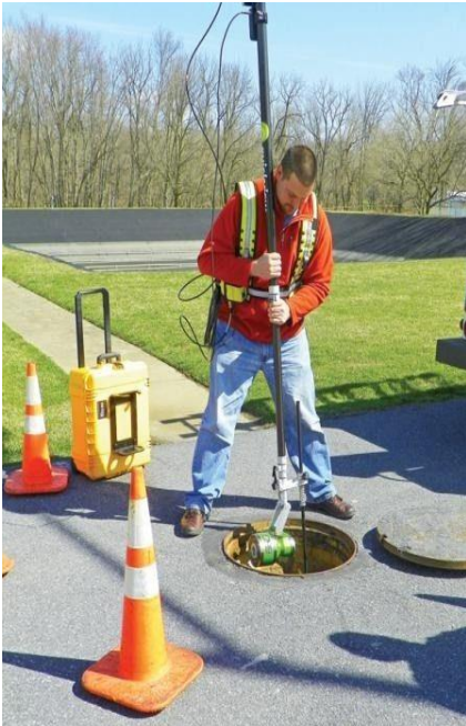
Typical Manhole Inspection, Digital Image. Municipal Sewer and Water Magazine. July 2011. https://www.mswmag.com/editorial/2011/07/get_in_get_out

accordingly. There should be minimal disturbance to private property during this work during the sewer inspection. There should be no disturbance to private property during manhole inspections. Sewer service will not be interrupted during the sewer, manhole, or lateral inspections.