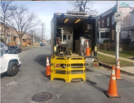
Example of typical CCTV inspection truck setup. In order to conduct CCTV inspections two trucks are needed, one at either end of the sewer.

Inspection of individual sewer segments typically takes 2-4 hours, depending on the length of sewer and number of lateral connections. The sewer segment inspections will consist of opening the manholes at either end of the sewer, inserting a crawling CCTV camera unit at one end and a jetting hose with a cleaning nozzle and root cutter at the other. The sewer will first be cleaned with the jetting hose and root cutter, then once the sewer has been confirmed to be appropriately cleaned the CCTV camera inspection will be performed which will identify the location of defects in the structure of the sewer and any sanitary laterals that enter the sewer from surrounding buildings. Once the sewer inspection is completed an inspection of the City-owned laterals (from the connection to the mainline sewer to just past the curb) will be performed. A different type of CCTV camera will be inserted in the sewer and will inspect each of the laterals individually.