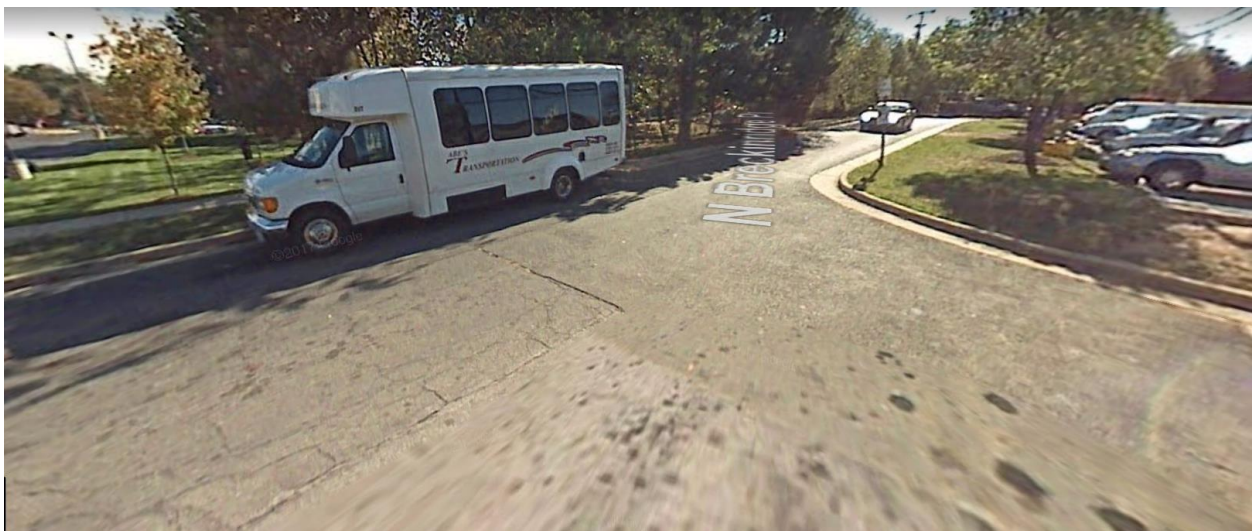
.....Same street but reverse view..