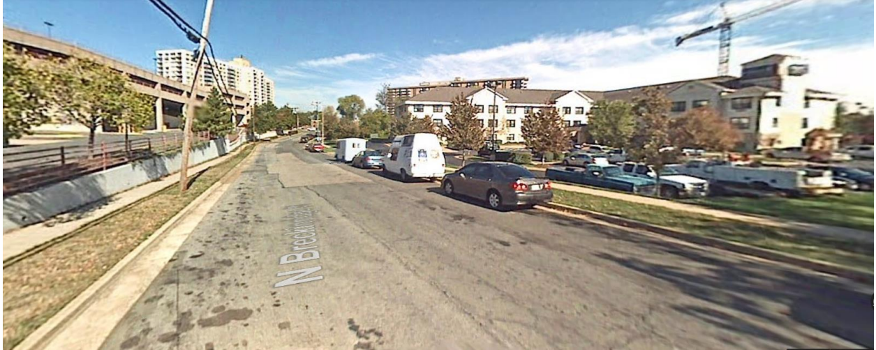
3. This truck owner park his car in replace of his truck, and vice versa.