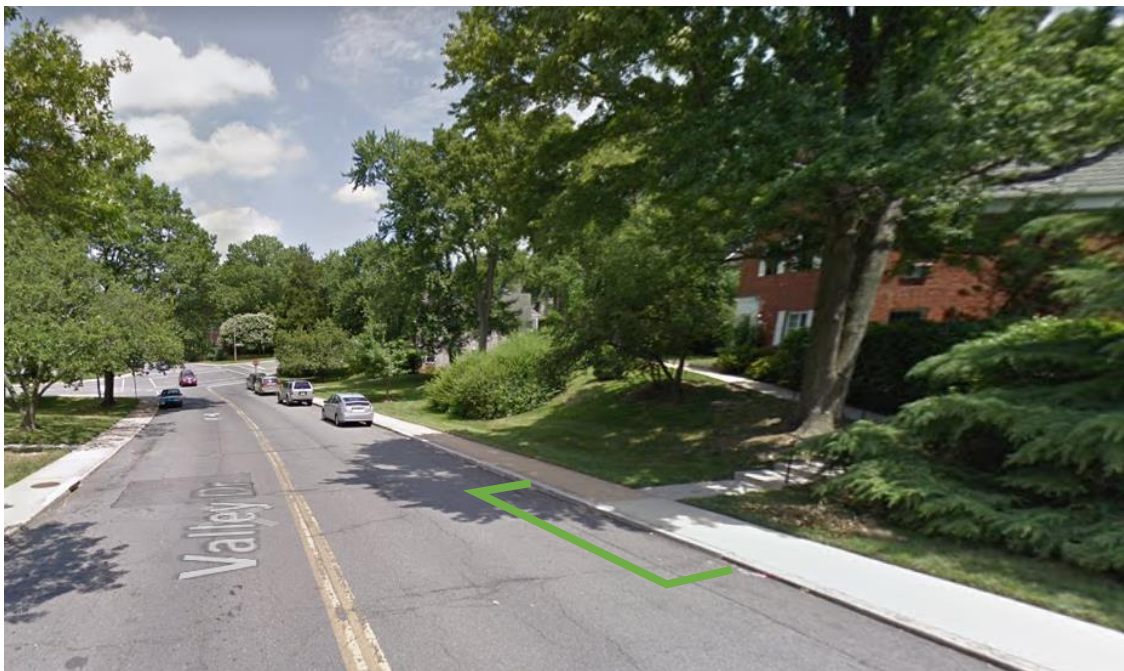
(Street view looking north, prior to disability signage installation)