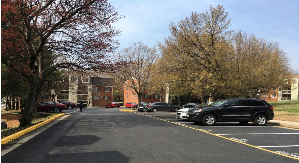
Community parking lot