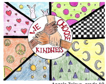
Angela Zelaya, grade 10