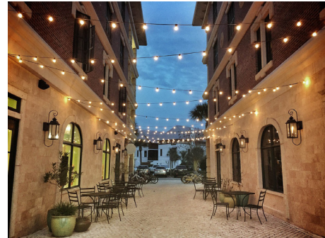
The image above is an example string lights. String lights provide light, give the park more of an identity.

*survey responses were limited for this park