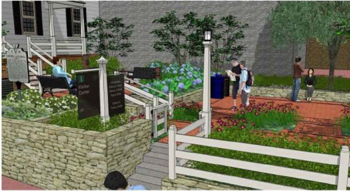
PERSPECTIVE FROM STREET