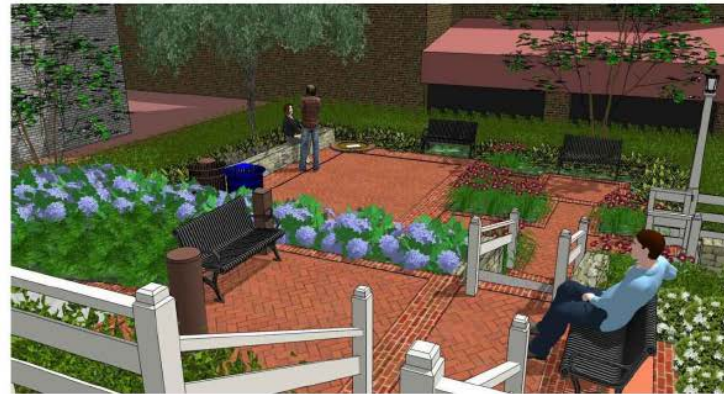
PERSPECTIVE FROM HOUSE