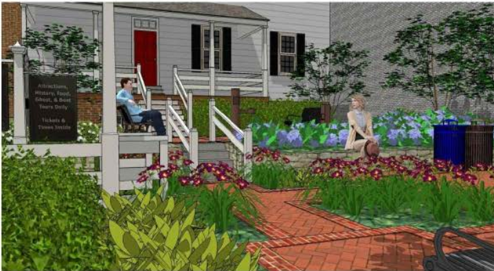
PERSPECTIVE FROM GARDEN