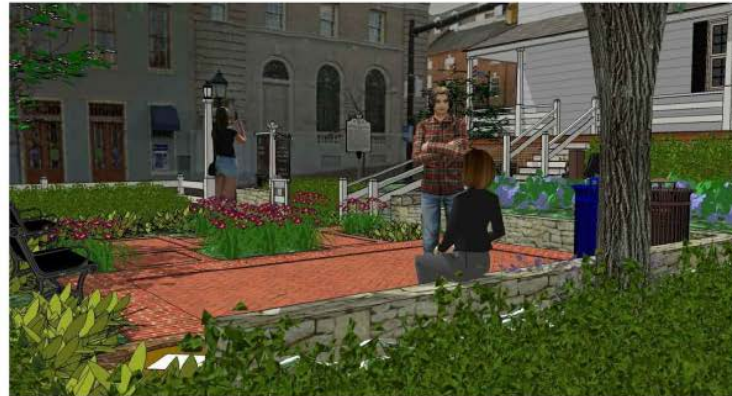
PERSPECTIVE FROM GATHERING COURTYARD