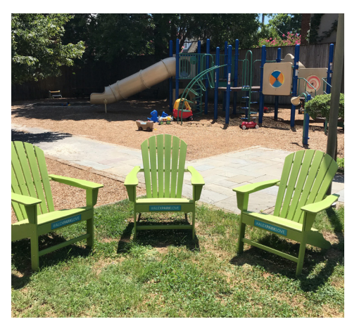
The image above is an example of movable seating that will be placed in Le Bosquet at Sunnyside Park to provide park users with additional seating and the ability to move them and use the open space as they see fit.