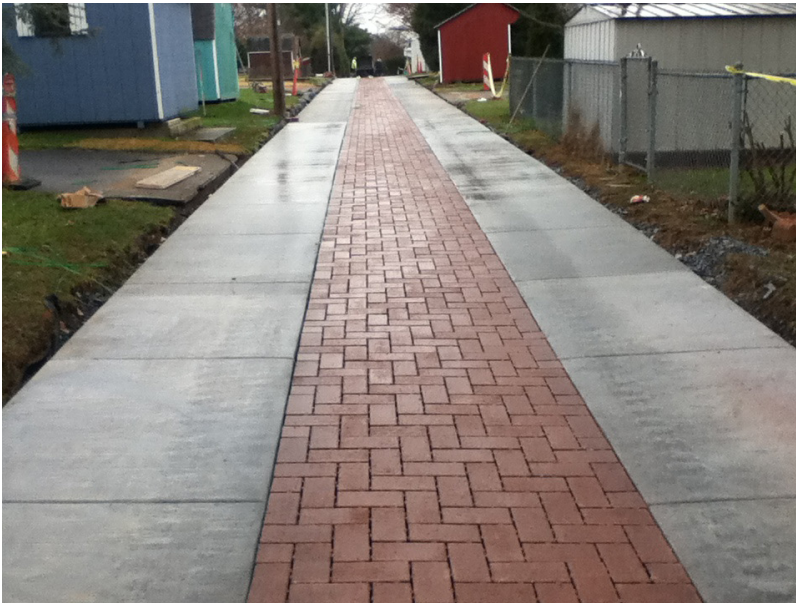
The image above is an example of a green alley. Green alleys are a form of green infrastructure that uses permeable pavement that mimics natural conditions to capture, filter, and slow down stormwater runoff before it enter the sewer system.