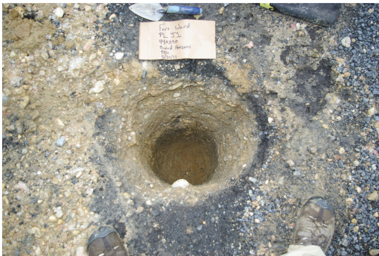
Plate 6. Shovel test hole punched through the museum parking lot showing a layer of fill that dates to the Civil War period at a depth of 2.0 ft. below grade.