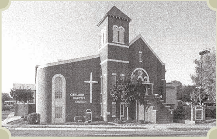
Oakland Baptist Church.

Several residents of “The Fort” community were founders of the Oakland Baptist Church, which is located at the intersection of King Street and Braddock Road. The congregation started worshipping in a bush arbor as Oak Hill Baptist Mission in 1888, established the church in 1891, and moved to the current location at 3408 King Street two years later. Despite the hardships associated with the community’s displacement and the development of Fort Ward into a historical park, the Oakland Baptist Church and Cemetery survive and stand as symbols of the self-sufficiency, integrity and longevity of this distinctive African American community.