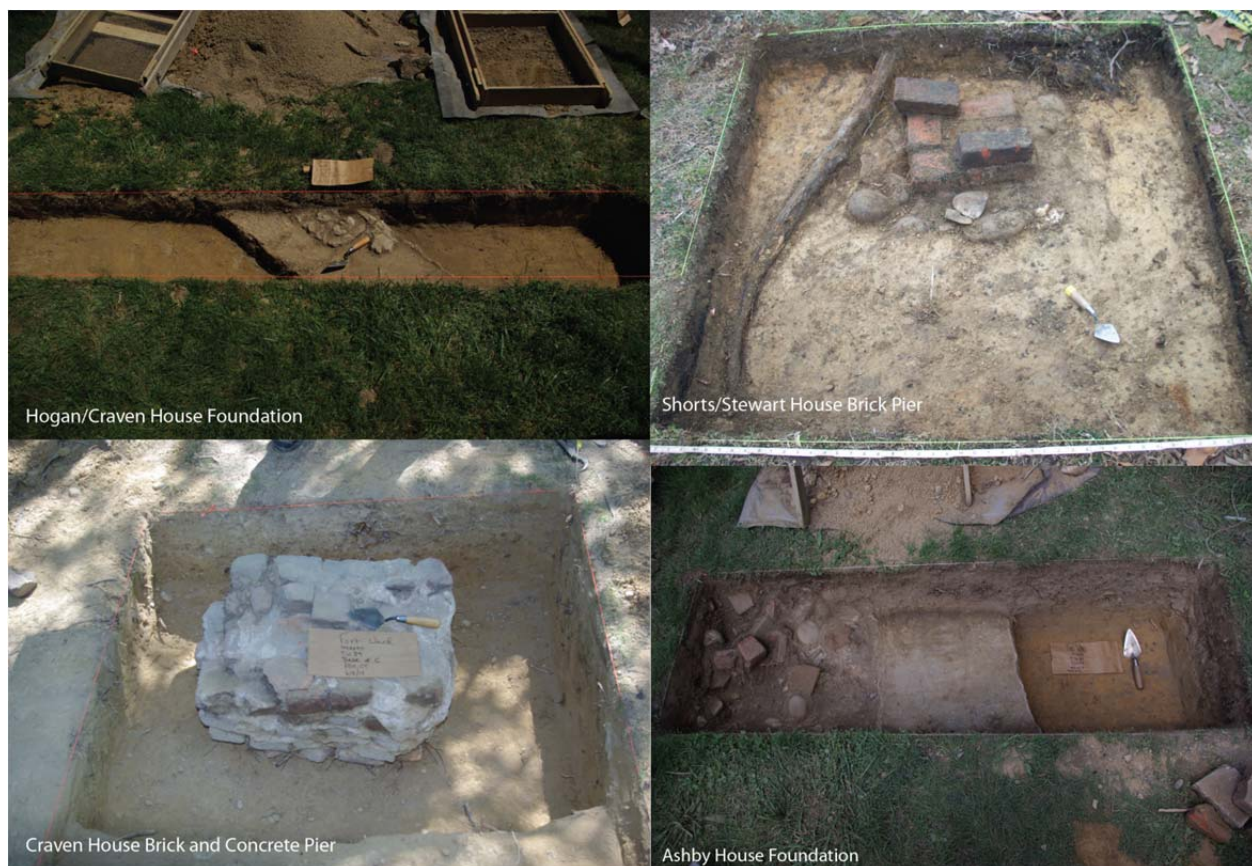
Plate 7. A variety of the masonry foundations exposed in the test units, all structures associated with The Fort community, ca. 1870-1960.