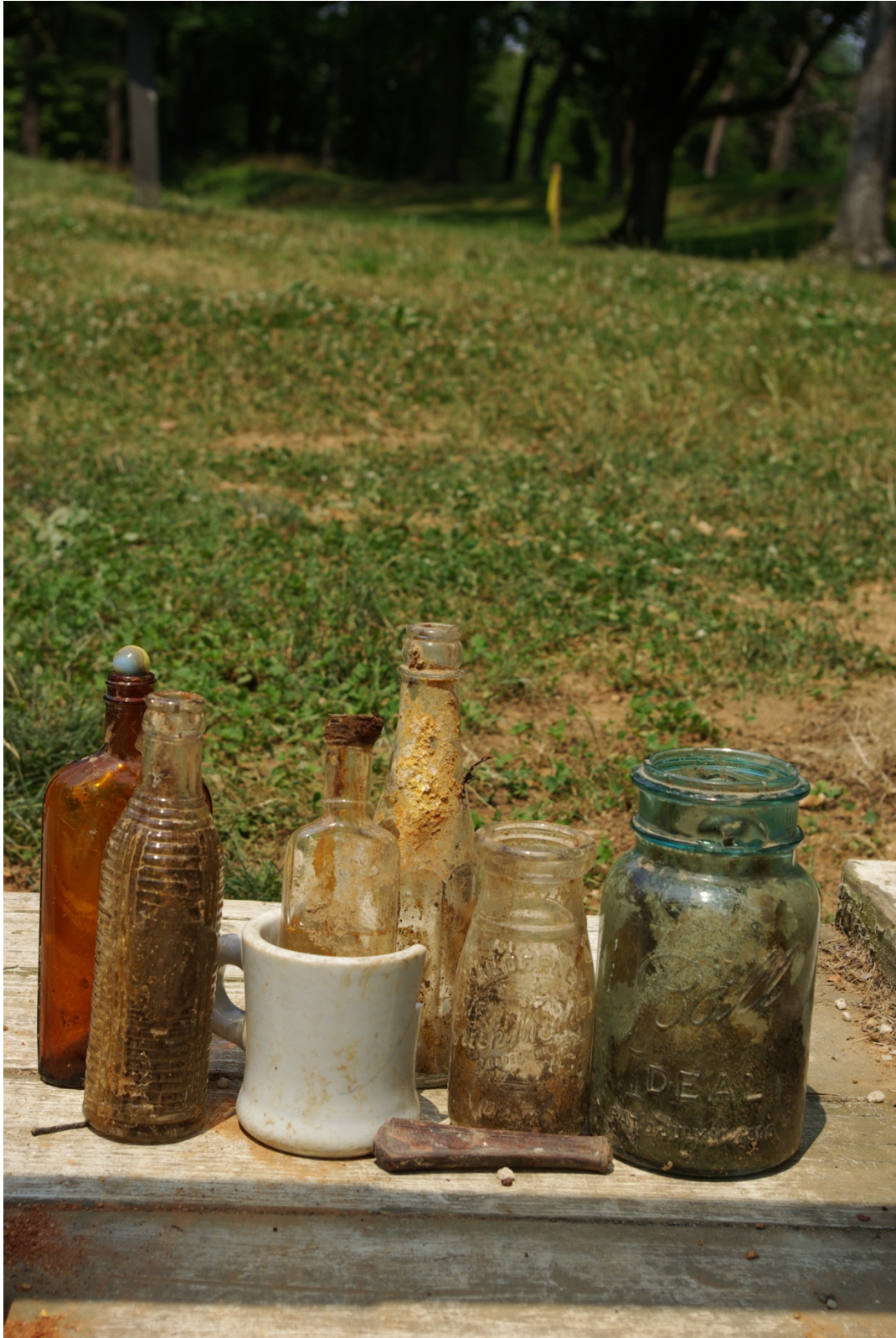
Plate 11. Findings from a 1930s-era privy located at the McKnight House situated inside Fort Ward.