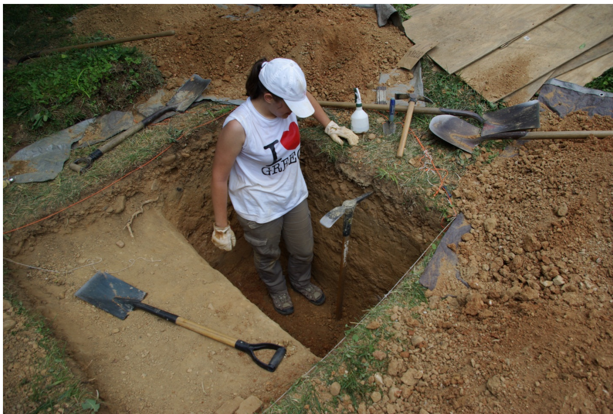
Plate 10. Deep digging along the east edge of Fort Ward.