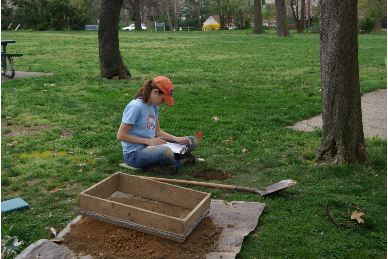
Plate 2. Recording soil layers in a shovel test pit.