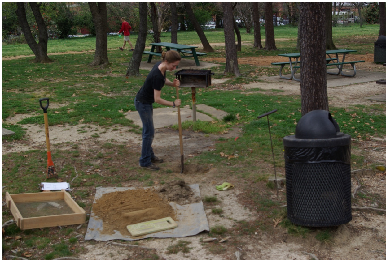
Plate 1. Excavation of a shovel test pit in the west picnic area.