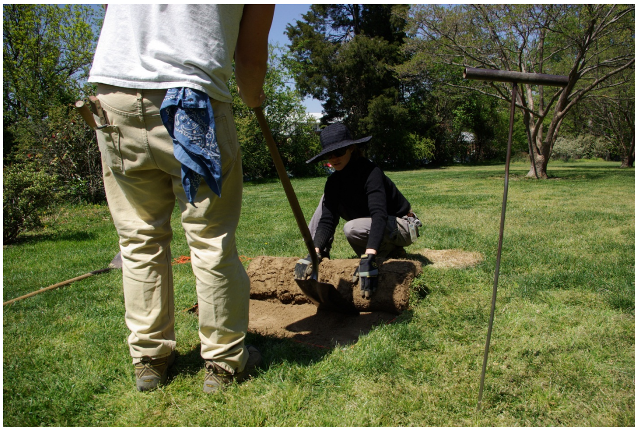
Plate 3. Peeling back the sod in a test unit on the west side of the park.