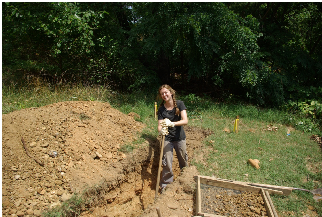
Plate 9. Flat shoveling the bottom of a test trench located to the west of the Oakland Baptist Church Cemetery.