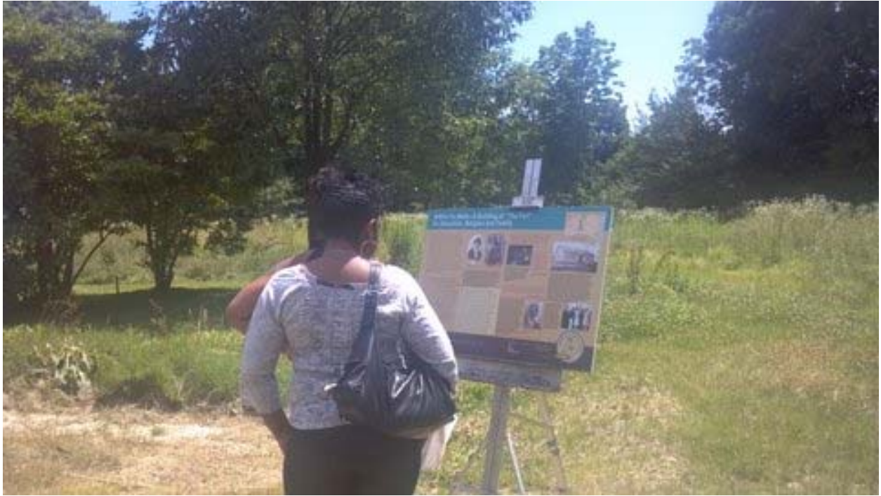
Plate 13. Attendees at June 2, 2012 event “We’re Still Here!” hosted by the Fort Ward & Seminary African American Descendants Society, Inc. view prototype of one of the six interpretive history signs developed by OHA staff with a grant from National Trust for Historic Preservation and Ford Foundation. Descendants and members of the Fort Ward History Group contributed to the sign development by selecting themes, conducting research and providing memories and direction. City of Alexandria/OHA and Fort Ward Museum & Historic Site were one of the co-sponsors of the event