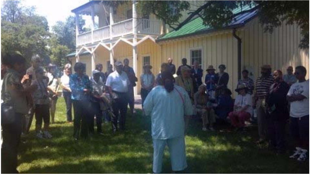
Plate 14. More than 500 brochures corresponding to the six interpretive signs developed by the grant from the National Trust for Historic Preservation and Ford Foundation were distributed during the event. Historic images and oral history in the brochure and signs evoke 'The Fort' and larger Seminary community. After nearly 100 years, the African American residency ended when Fort Ward Park was established. Descendants of the community continue to live nearby.