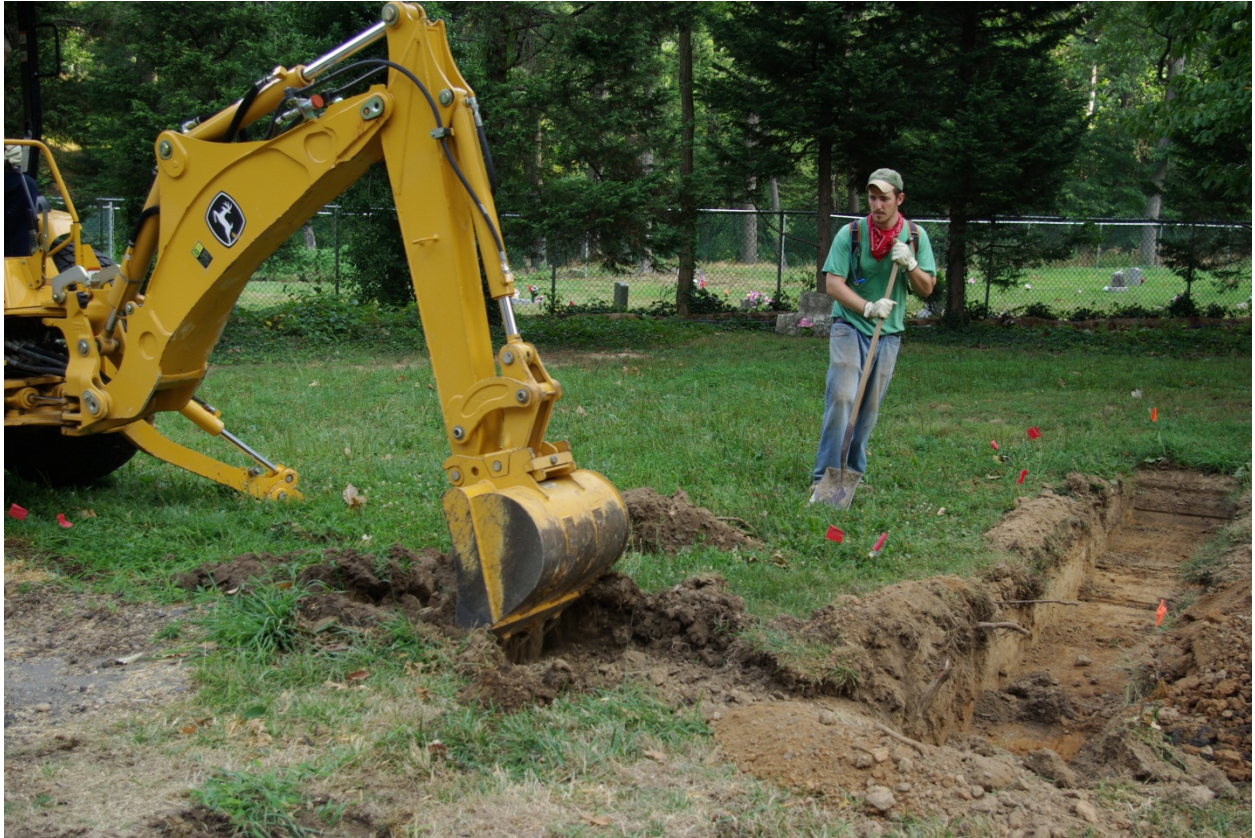
Plate 8. Monitoring trenching along the south edge of the Old Grave Yard.