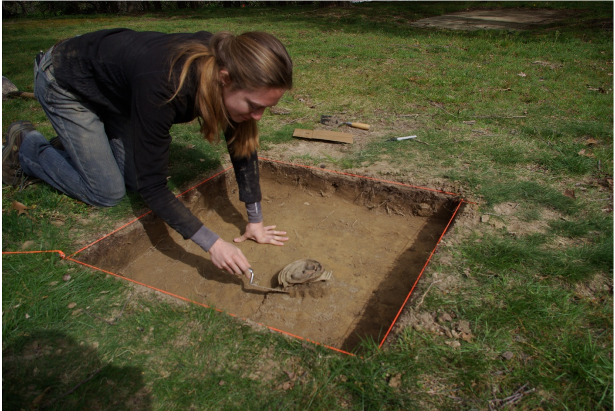
Plate 4. Excavation of a Civil War oil lamp located in the north end of the park near the redoubt.