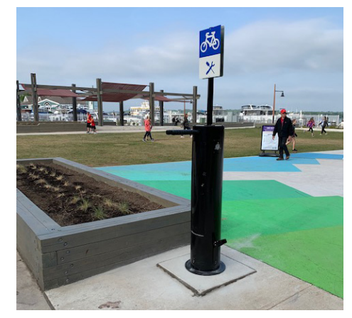
The image above is an example of a bike repair station, located in Waterfront Park. A bike repair station provides users with all the tools needed to perform basic bike repairs and maintenance. The tools are attached to the stand and the station allows for a bike to be hung while it is being repaired.