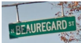
Large Sign - $450