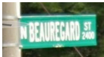
Basic Sign - $150

Data from City of Alexandria Department of Transportation and Environmental Services, Fall 2015 & Winter 2016