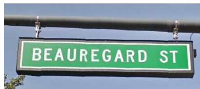
Illuminated Sign - $2,800

(Unit cost for all signs includes materials, fabrication, installation)