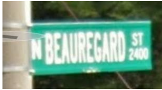
Basic Sign - $150

Data from City of Alexandria Department of Transportation and Environmental Services, Fall 2015 & Winter 2016