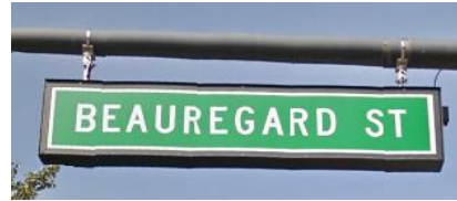
Illuminated Sign - $2,800

(Unit cost for all signs includes materials, fabrication, installation)