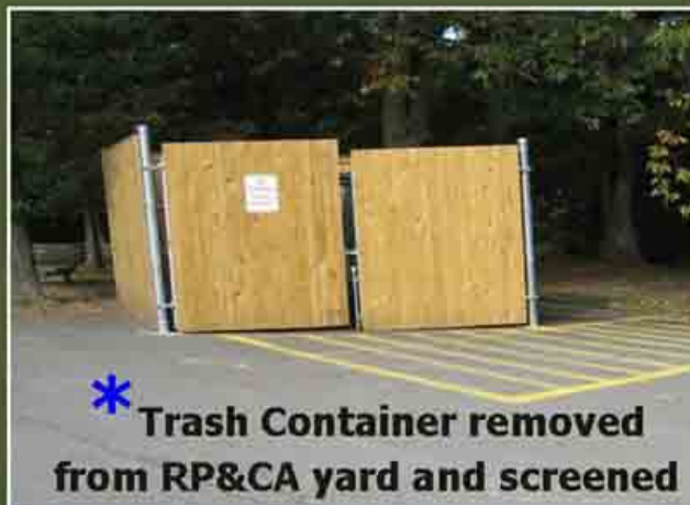
* Trash Container removed from RP&CA yard and screened