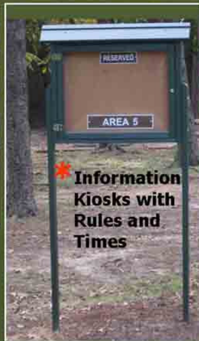
* Information Kiosks with Rules and Times