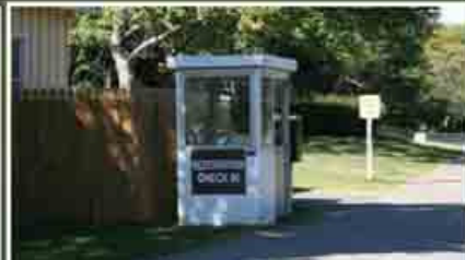
SECURITY CHECK IN BOOTH