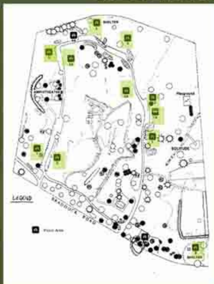
2007 map with 11 rentable areas