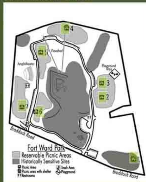
2008 map with 7 rentable areas