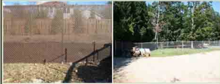
Fencing, Screening, & Debris Removal