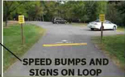
SPEED BUMPS AND SIGNS ON LOOP