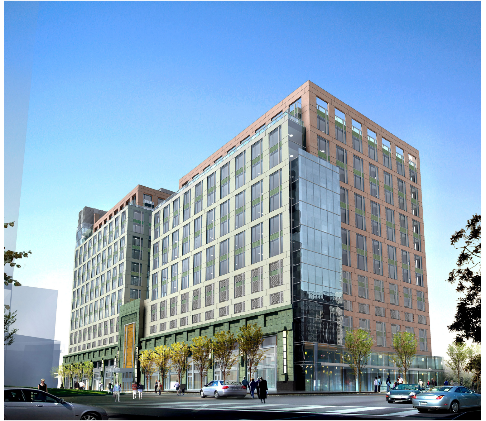
DRB Approved North Elevation