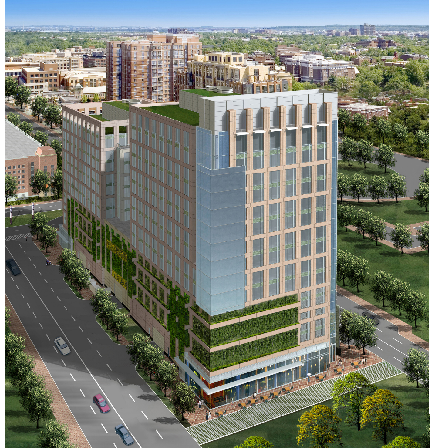
DRB Approved West Elevation