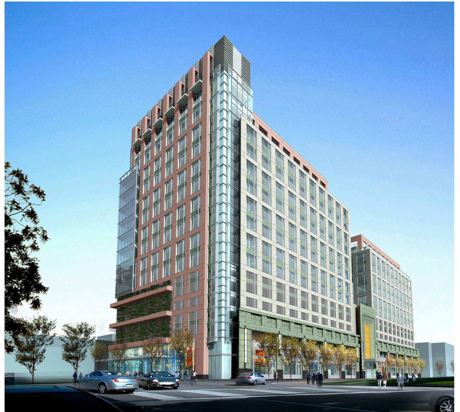
DRB Approved East Elevation