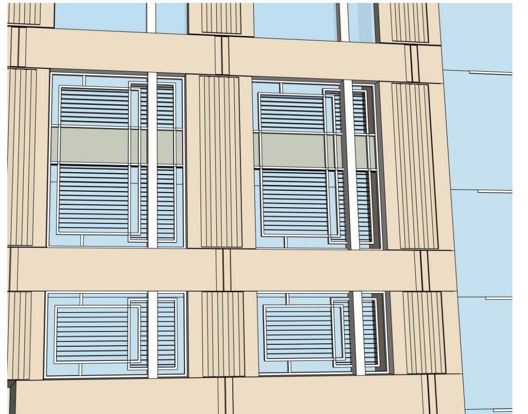
DRB Approved Design