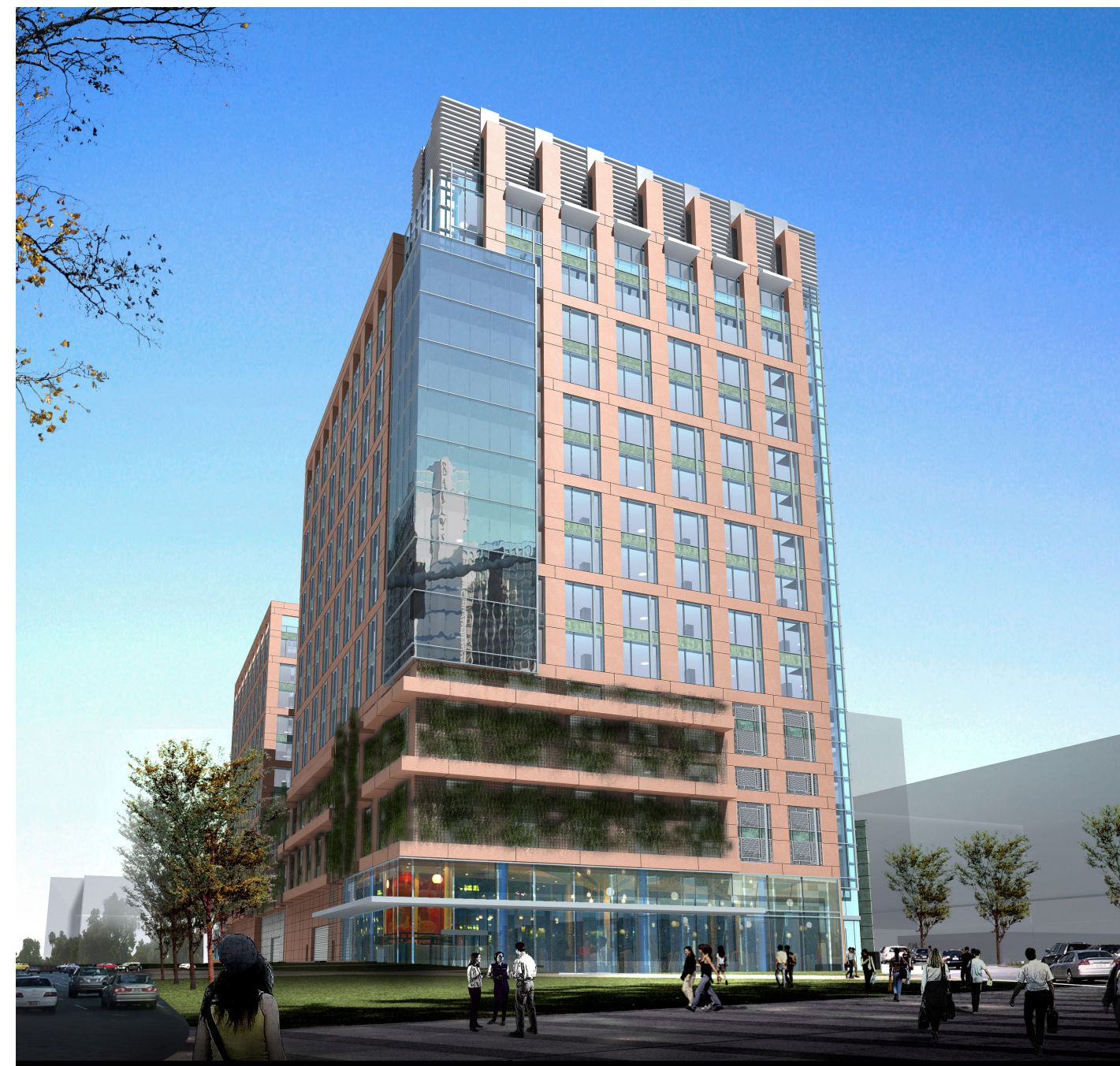
DRB Approved South Elevation