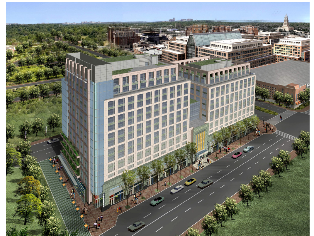
DRB Approved Design