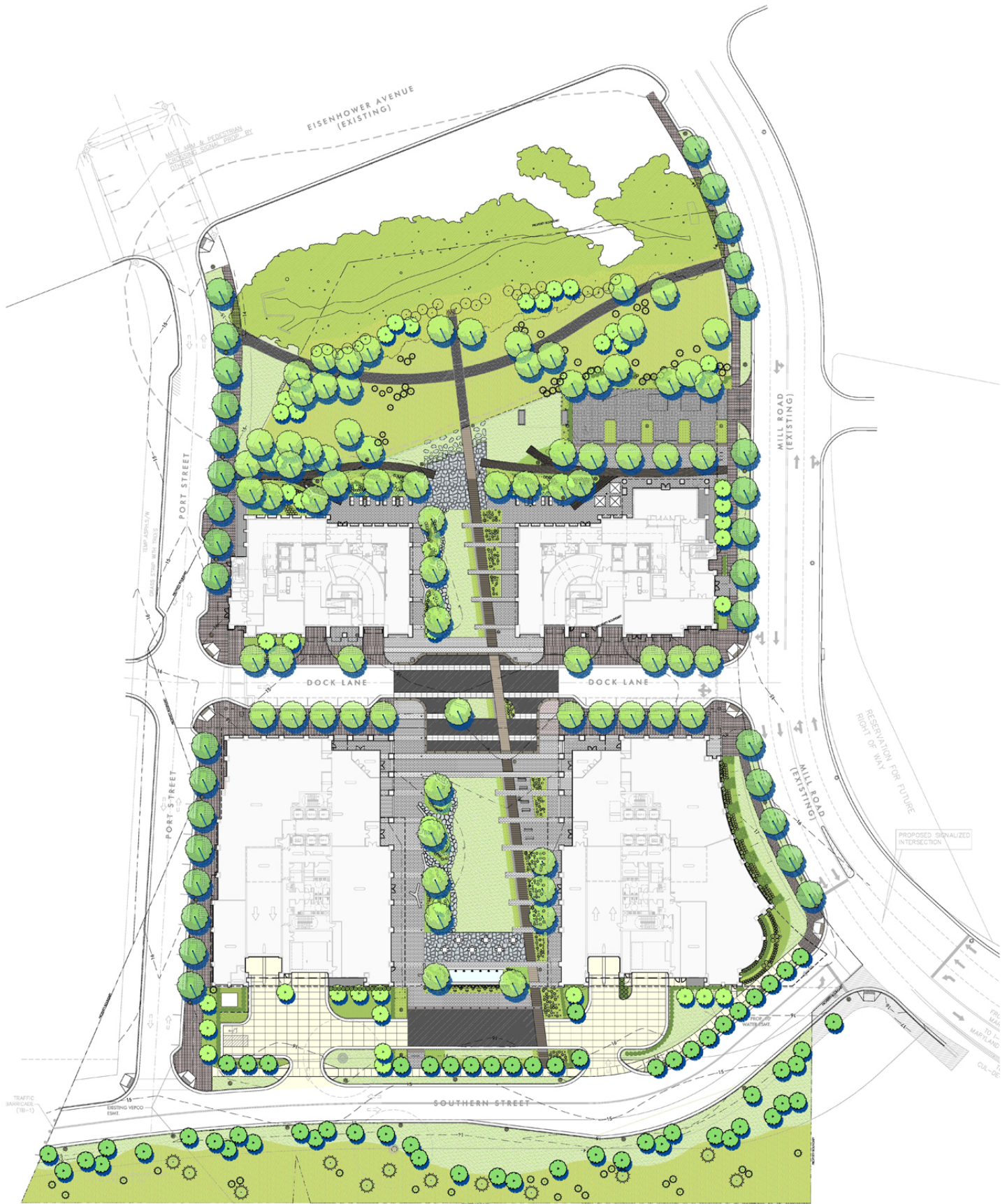
Figure 1-Previously Approved Block 19 & Block 20 Plan