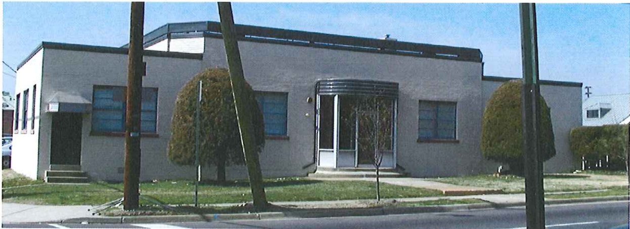
600 North Henry Street

One of the issues related to the park design will be the possible preservation or memorialization of a portion of the now City-owned building at 600 North Henry Street. The eastern façade of the one-story brick ca. 1940 commercial building is a good example of the Streamline Moderne architectural style, characterized by the curving stainless steel canopy over the entry and steel windows with horizontal muntins. The building is not within our local Parker-Gray Historic District, so demolition would not require a Permit to Demolish from the BAR, but it is noted as a contributing structure in the recently adopted Parker Gray National Register Historic District. There are alternatives to the preservation of the building in situ, such as removing the entry canopy and windows, storing and reusing them as part of the new development on the site; or using the form of these architectural features as part of the design of the new development without actually preserving the features themselves.