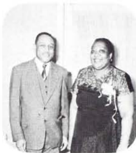
"SICK & SHUT-INS"