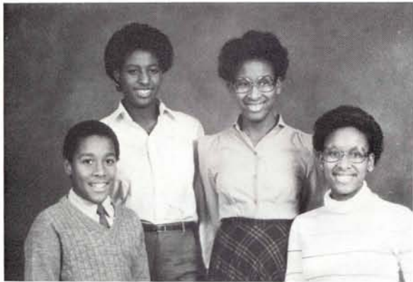
METHODIST YOUTH FELLOWSHIP