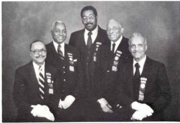
MEN USHER BOARD