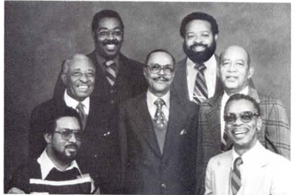
UNITED METHODIST MEN