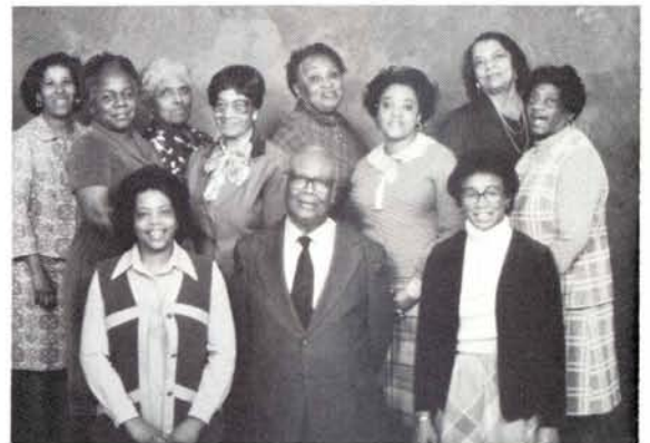
UNITED METHODIST WOMEN