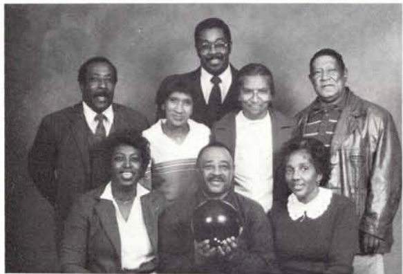
CHURCH BOWLING TEAM