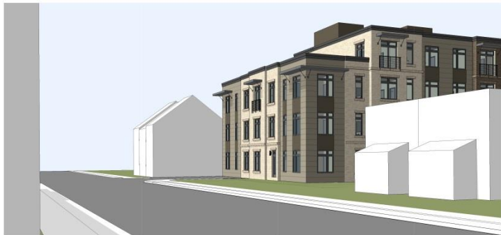
3 A4 PENDLETON LOOKING WEST