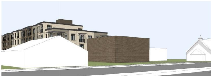
1 A4 WYTHE LOOKING WEST