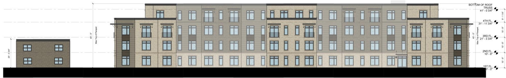
1 NORTH PATRICK STREET ELEVATION A3 3/32" = 1'-0"

*Illustrative only: architecture will be developed once a preferred concept is selected