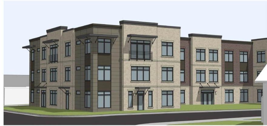
2. WYTHE LOOKING EAST