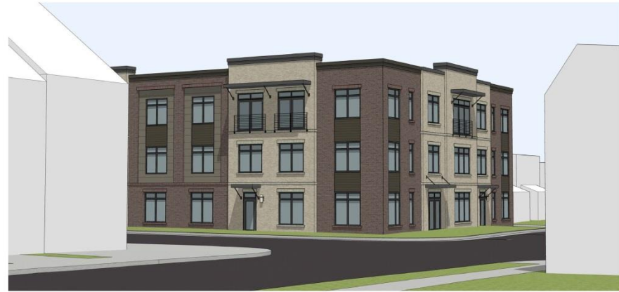
4. PENDELTON LOOKING EAST

*Illustrative only: architecture will be developed once a preferred concept is selected