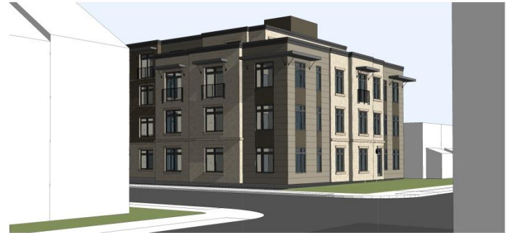
4 A4 PENDLETON LOOKING EAST

*Illustrative only: architecture will be developed once a preferred concept is selected