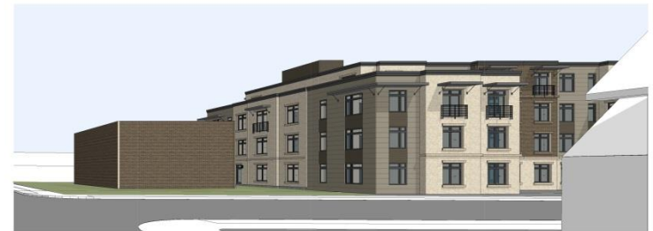
2 A4 WYTHE LOOKING EAST