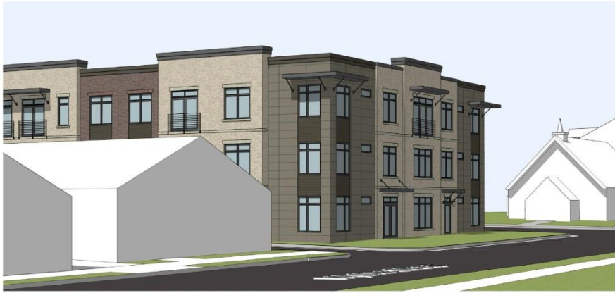
1. WYTHE LOOKING WEST