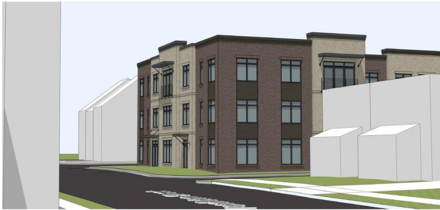
3. PENDELTON LOOKING WEST