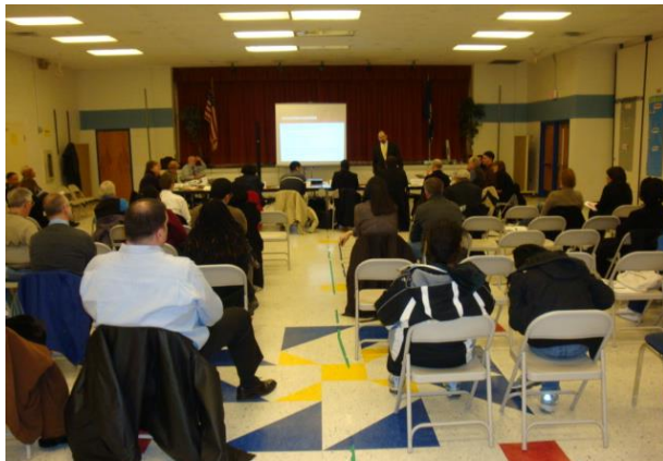
Joint Presentation to Housing Master Plan Working Group

To facilitate successful and viable operations, ARHA is working to strengthen its relationships with Residents/ Clients, Community, and governmental entities. We emphasize effective communication, provision of needed information, and utilizing inclusionary planning processes. We are initiating plans to provide added support to customer service and the delivery of information. Along these lines, we are in the process of launching a new interactive client/user friendly website, and we are publishing newsletters and holding routine neighborhood interaction meetings. All of these activities represent our continued commitment to solicit and deliver timely and accurate information regarding our agency, our programs, our residents, and our community.