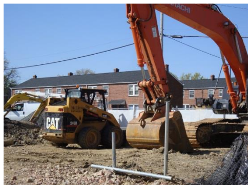
Construction at Old Town Commons

ARHA will encourage the formation and operation of resident-owned businesses through its policies and contracting activities. Working with local job training and development agencies, we will facilitate and support outreach and training activities and provide technical assistance to enable resident-owned businesses to contract with those who do business with us. Accomplishment of this goal will require efforts by ARHA staff, as well as, training and support provided by local business development entities.