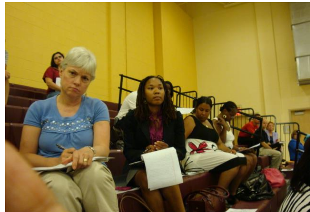
Participants at ARHA Town Hall Meeting-Strategic Plan