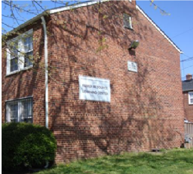
Montgomery Street Learning Center

ARHA will conduct a survey of all ARHA households to determine levels of academic and professional attainment and the desire of household members to increase that level of attainment. The information from the survey will be used for service planning, establishing program performance baselines and for reporting progress. Achievement of this goal can be accomplished with the allocation of a limited amount of funds for the performance of the resident needs assessment and analysis of the results and the allocation of ARHA manpower.