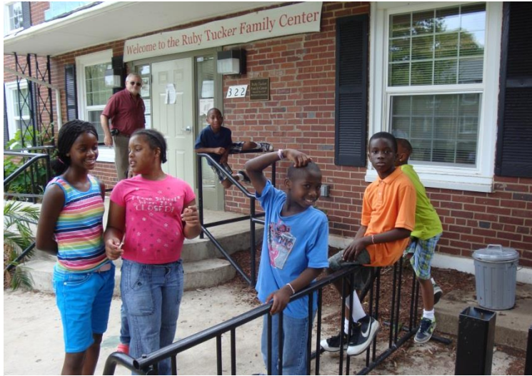
Ruby Tucker Center at Hopkins-Tancil