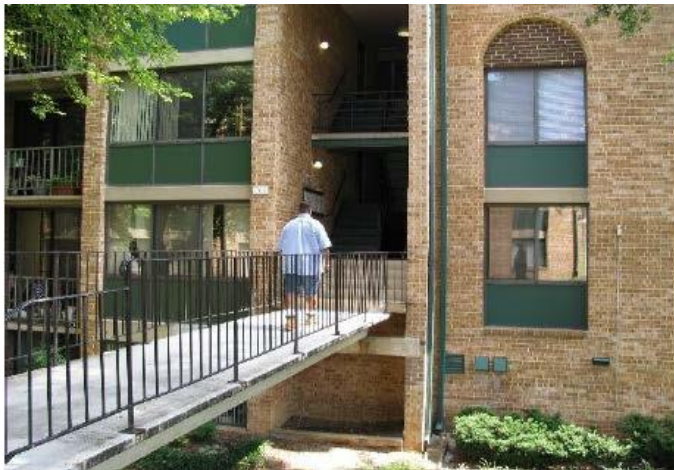
Saxony Square Today

based on Section 8 program guidelines. The increase in operating income should enable the agency to continue to operate these units as housing that is affordable to lower income households. Approximately $45,856 12 will be required over the next ten years to accomplish the conversion and to provide subsequent capital improvements. The primary sources of these funds will be $8,000 in CFP funds for the conversion activities and $38,000 in subsequent year capital improvements. 13