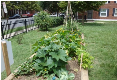
Community Garden at Hopkins-Tancil

populations in the growth and prosperity of ARHA and the Community has resulted in the creation of new mechanisms for two-way communication, collaboration and meaningful input into the planning and operation of ARHA and our associated communities.