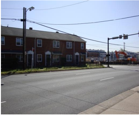
James Bland Today