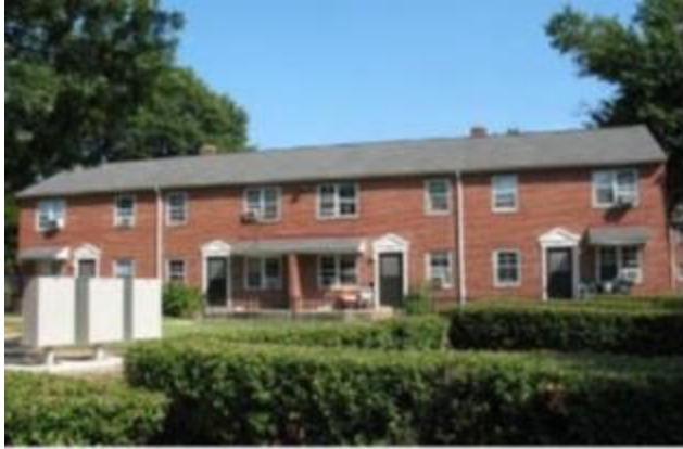
Example of Building in James Bland Homes - Alfred St

Between 1941 and 1959, ARHA stepped in and relocated families, cleared blight and built several public housing developments such as