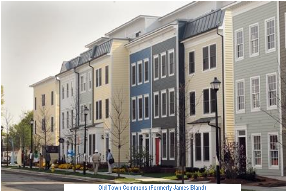
Old Town Commons (Formerly James Bland)

ARHA is a seasoned developer of affordable housing . A mutually beneficial partnership between ARHA and a private developer is transforming the old James Bland community into Old Town Commons , one of the most attractive communities in Alexandria. This community of townhouses for ownership and affordable rental units is within walking distance to downtown Alexandria and the Potomac River. With the first phase completed, it appears to be eagerly accepted by a community that was desperate for change. ARHA is also active in the preservation of affordable housing . We recently acquired Pendleton Park , a privately-owned, Section 8 Project-Based fully occupied site that was at risk of losing its affordability. This property is being rehabilitated and will maintain its affordable nature through the benefits of low-income housing tax credits.