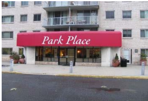
Park Place Today

ARHA’s condo units at Park Place are losing money because tenant rents and subsidy are insufficient to cover operating costs. We will convert these units to project-based assistance to enable ARHA to receive rental income based on Section 8 program guidelines. The increase in operating income should enable the agency to continue to operate these units as housing that is affordable to lower income households. Approximately $ 363,000 10 will be required to achieve appropriate conditions for the conversion and an additional $169,000 will be required for future capital improvements in years 6-10. 11 The primary source of funds to bring the units up to market standards will be Capital Funds. Replacement reserves will be used perform future capital improvements.