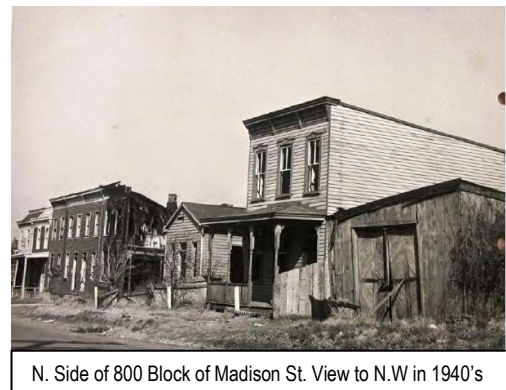
N. Side of 800 Block of Madison St. View to N.W in 1940's

Early in its existence, ARHA fulfilled its priority mission of clearing slums and creating new decent and affordable housing in the Berg and Parker-Gray sections of the city. Characterized by dilapidated homes and warehouses, this area of the city had seen little capital investment during the depression era. In the 1930s, a greater awareness of substandard housing (often called slums) was evident in American life. Many individuals felt that the slums contributed to high crime rates and posed a problem to public health.