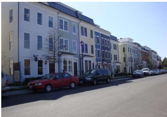
Old Town Commons