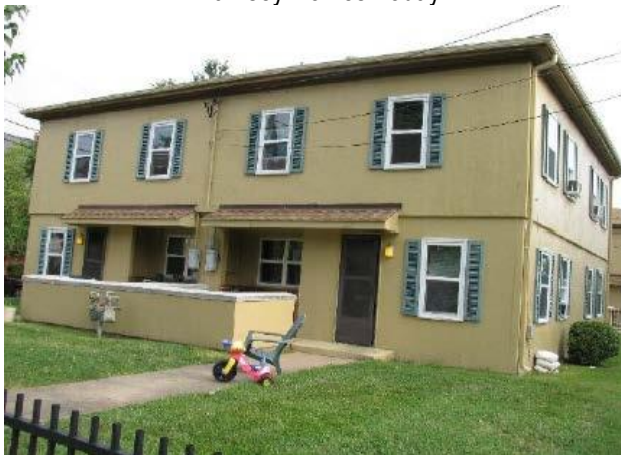
Ramsey Homes Today