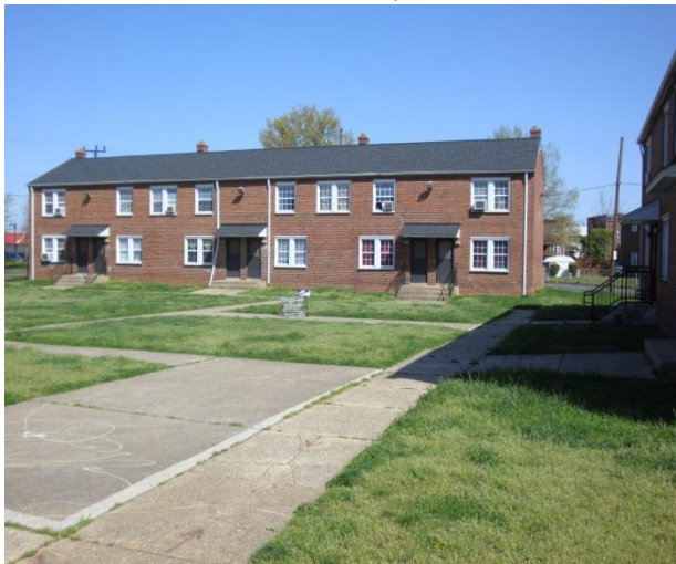
Samuel Madden Today