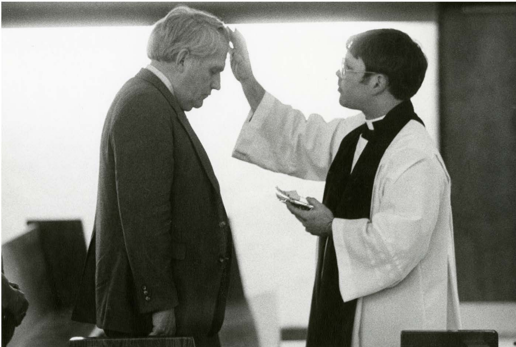
Imposition of Ashes at Immanuel Lutheran Church