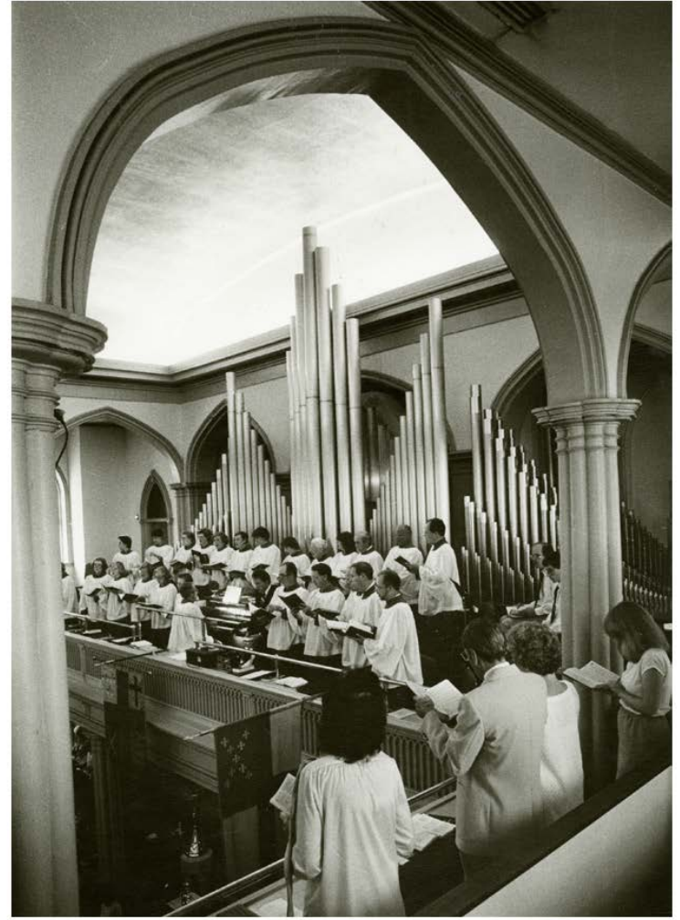
Choir at St. Paul's Episcopal Church