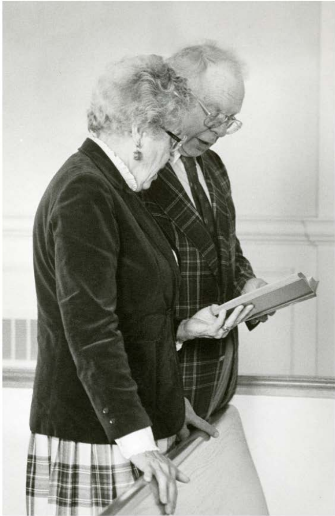
Singing Hymns at Beverly Hills Community United Methodist Church