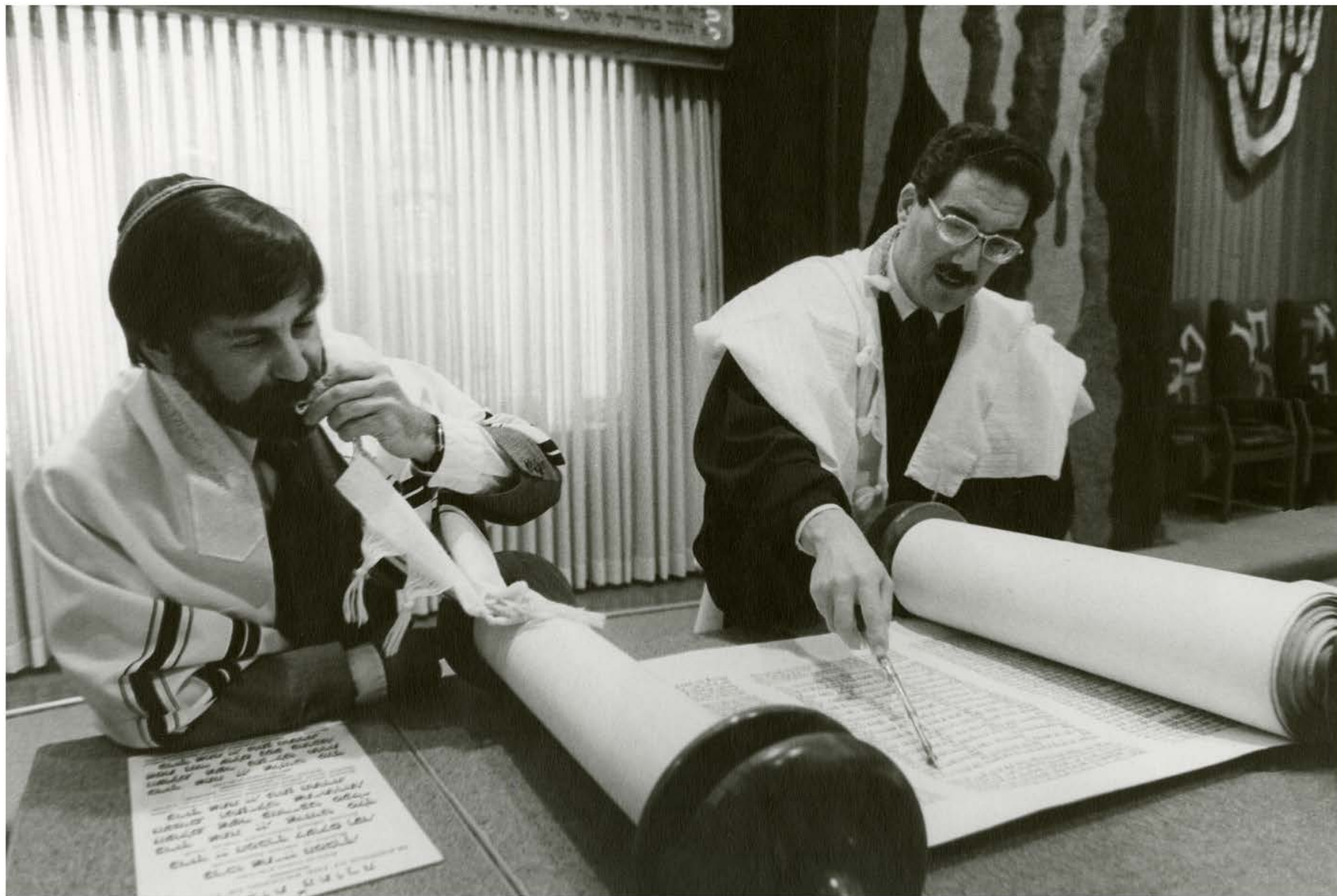
Torah Reading (Reenacted) at Agudas Achim Hebrew Congregation