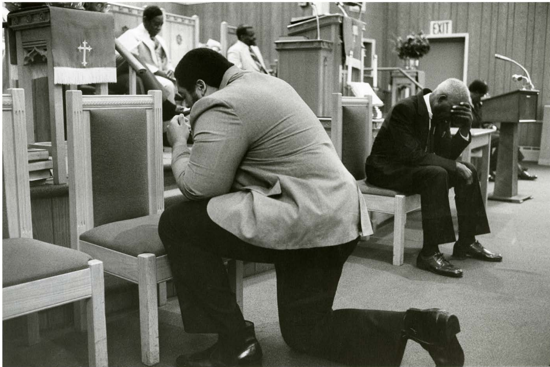
Silent Prayer at Third Baptist Church