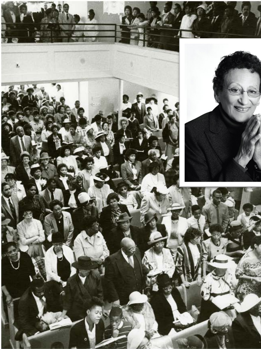
Homecoming at Ebenezer Baptist Church