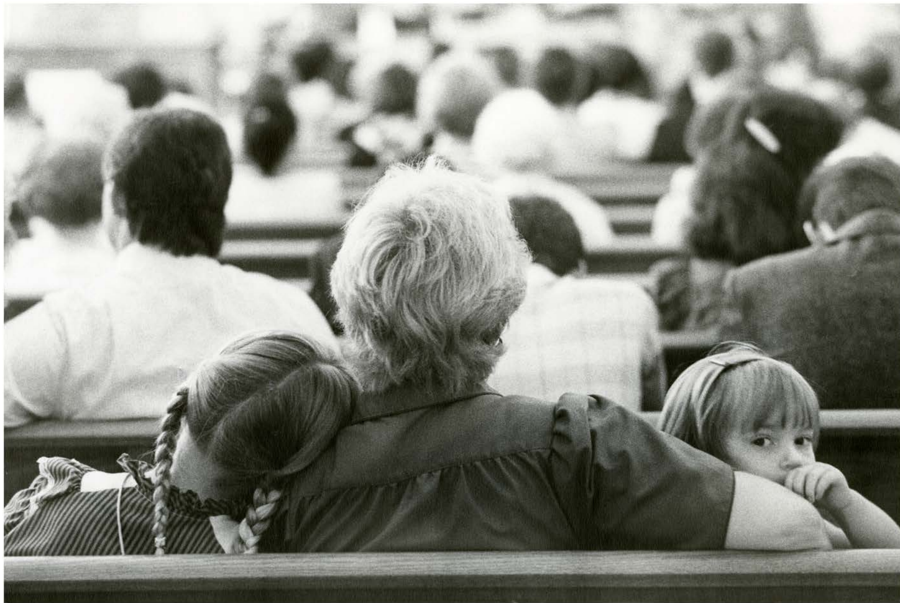
Worship Service at Church of Jesus Christ of Latter Day Saints