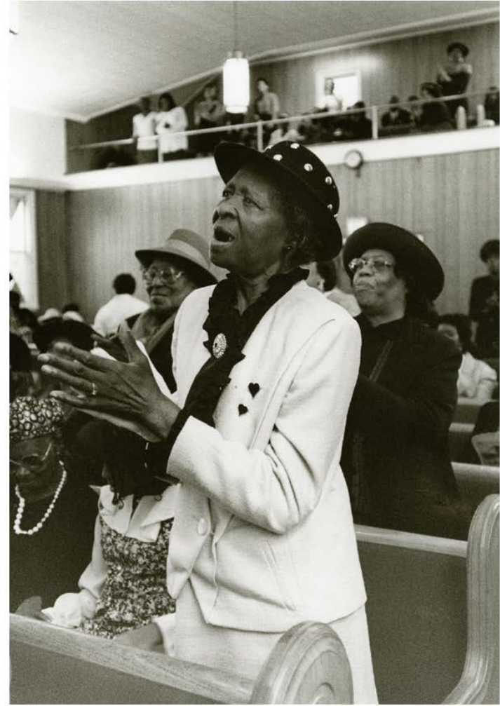
Gospel Song at Mt. Jezreel Baptist Church