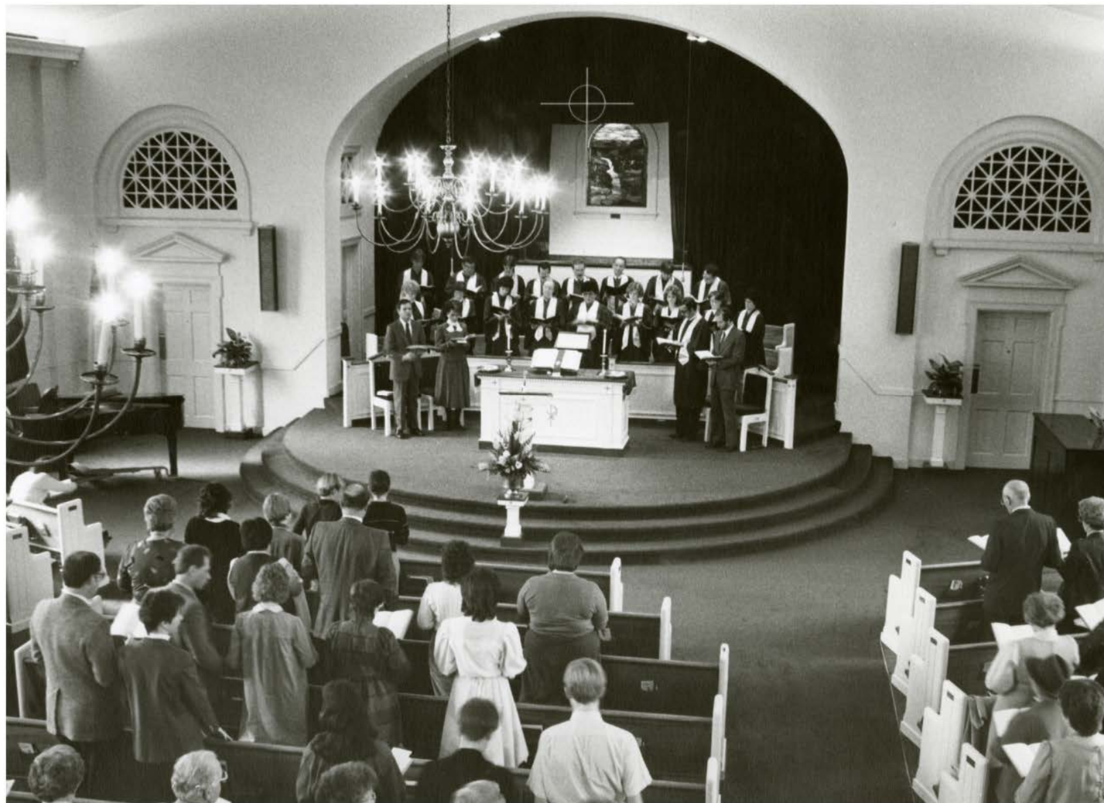
Worship at Baptist Temple