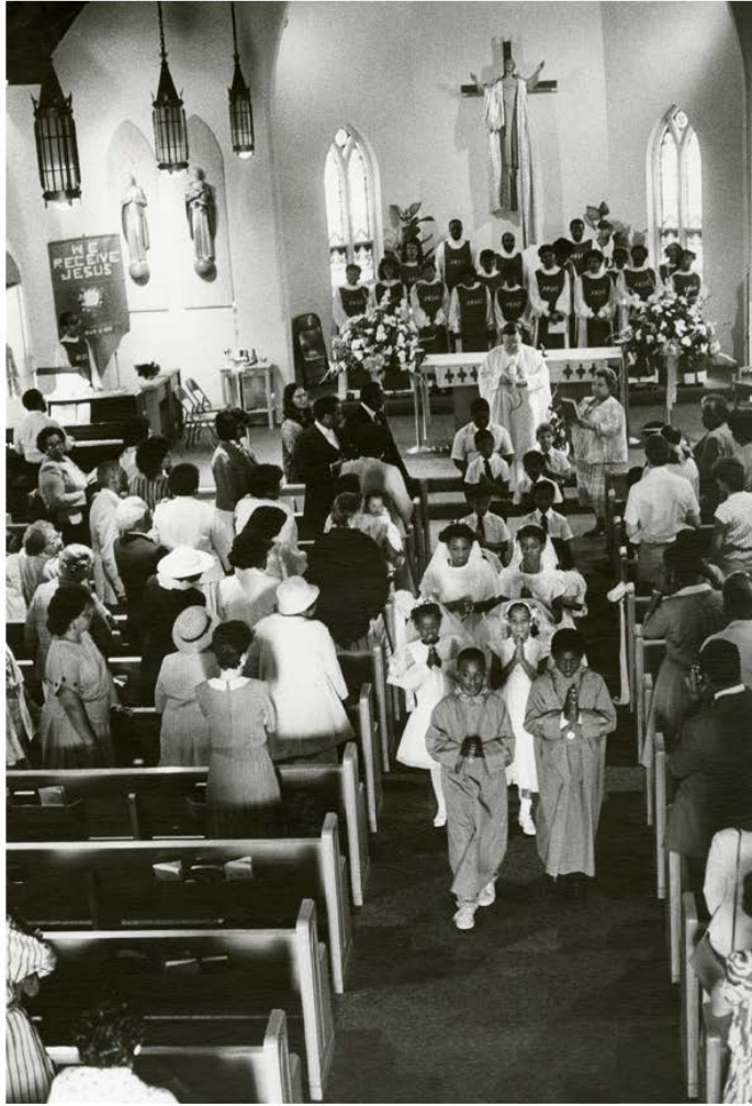
Recessional at St. Joseph's Catholic Church