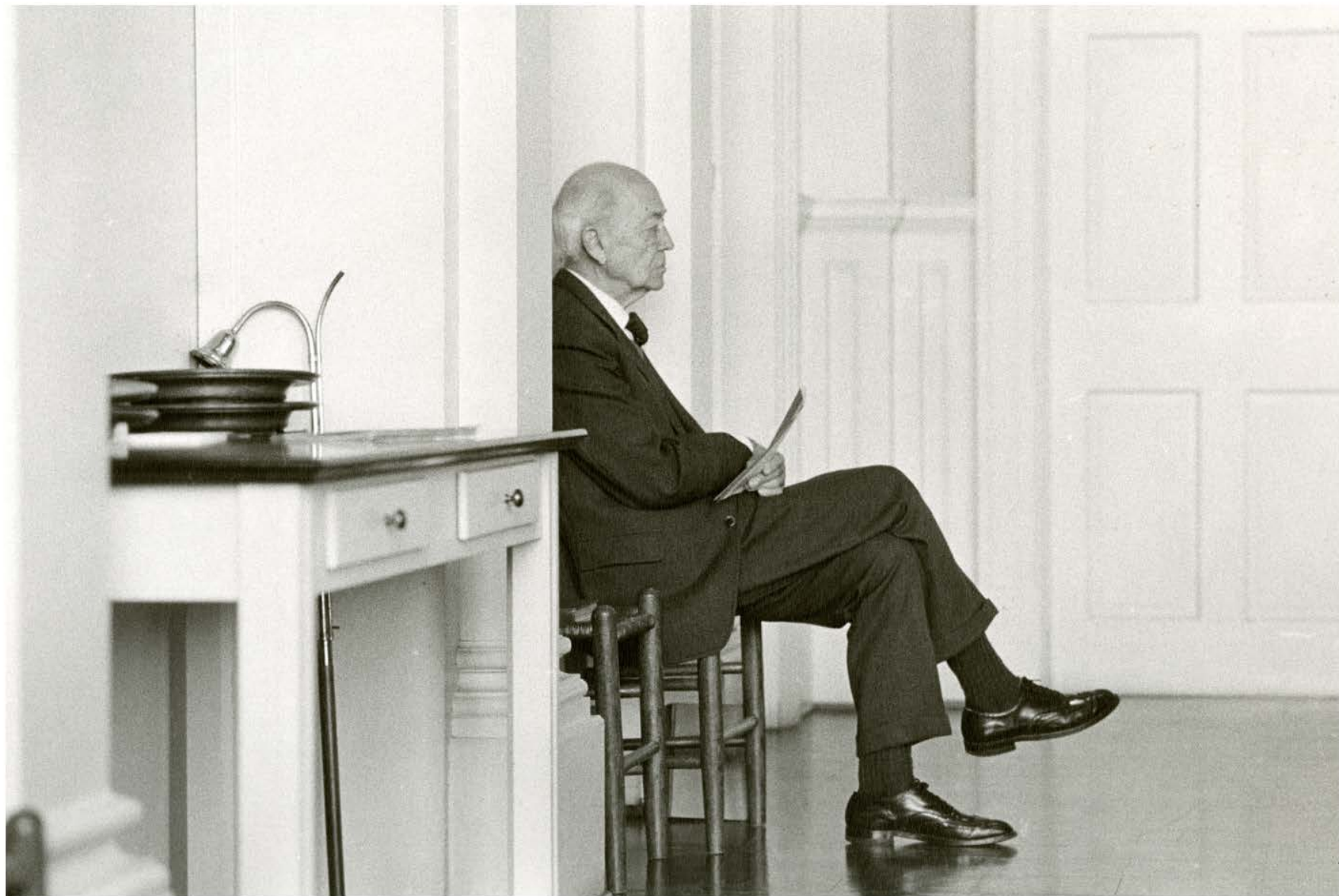
Usher at Beverley Hills United Methodist Church