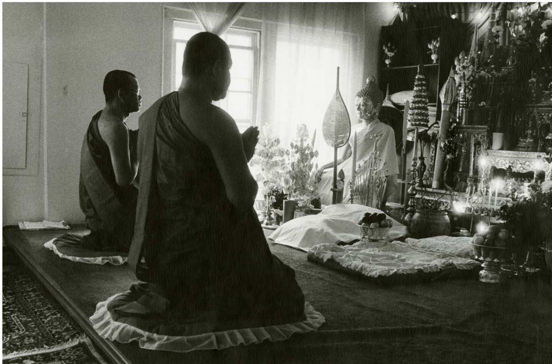
Worship at Wat Lao Buddavong