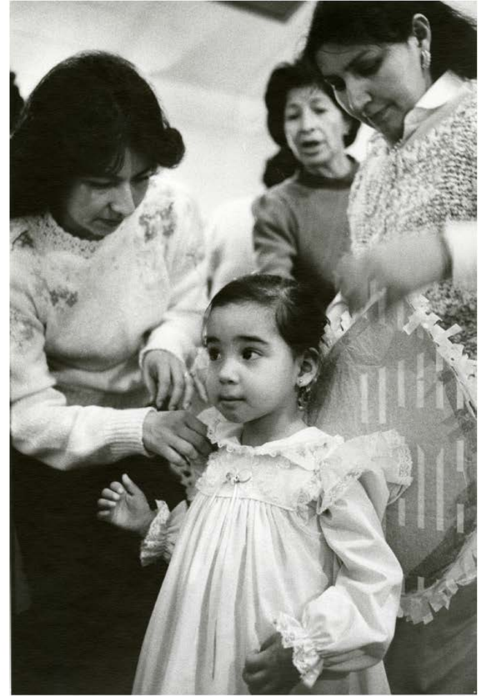
Epiphany Play, Spanish Mass at Blessed Sacrament Catholic Church