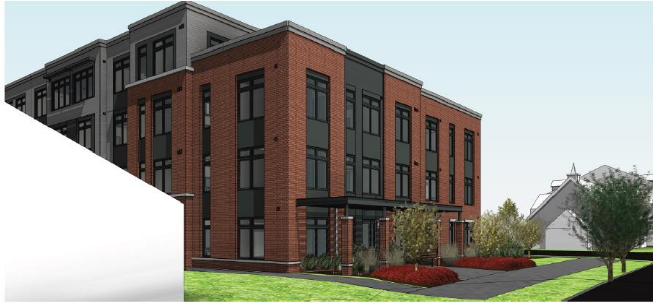
1 PERSPECTIVE - WYTHE STREET LOOKING WEST