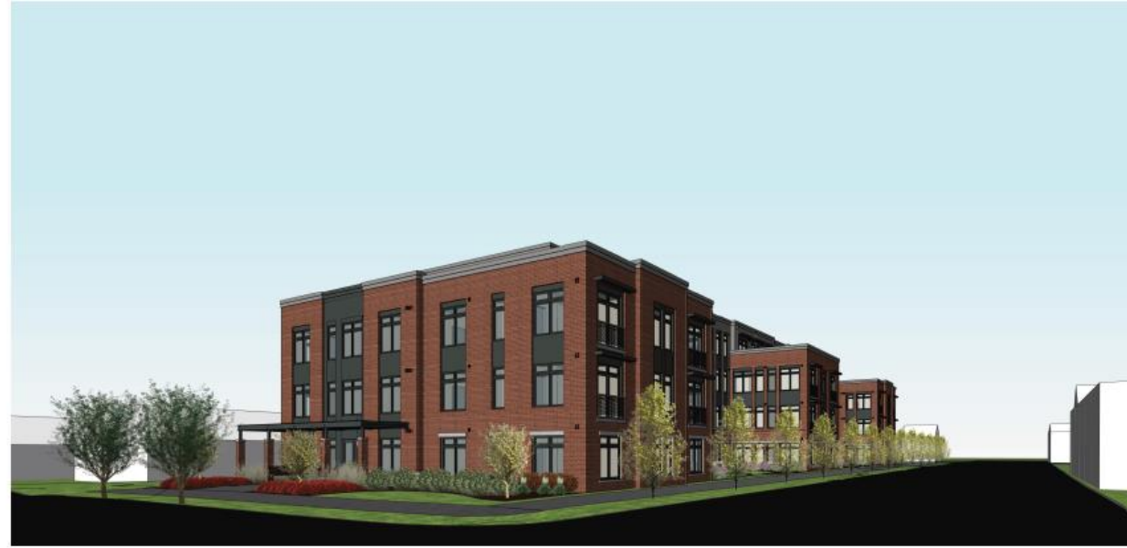
3 PERSPECTIVE - WYTHE STREET LOOKING SOUTH