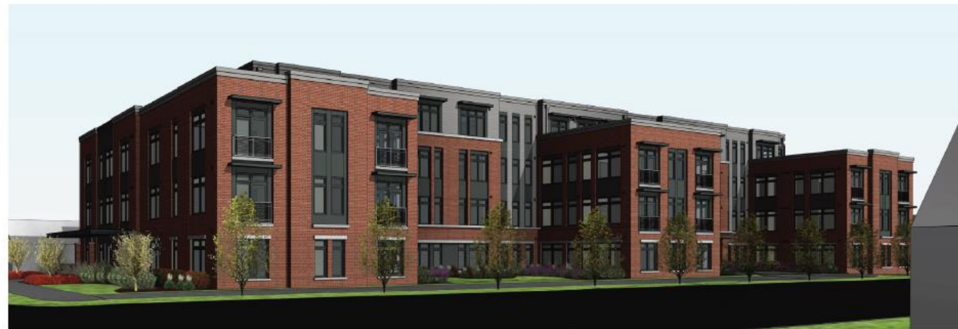
4 PERSPECTIVE - WYTHE STREET LOOKING EAST