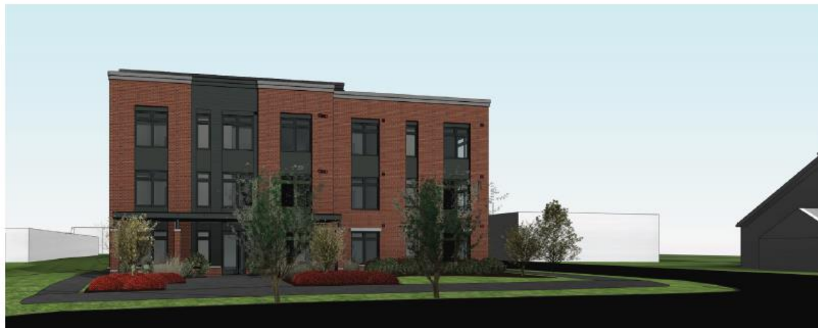
2 PERSPECTIVE - WYTHE STREET ENTRANCE