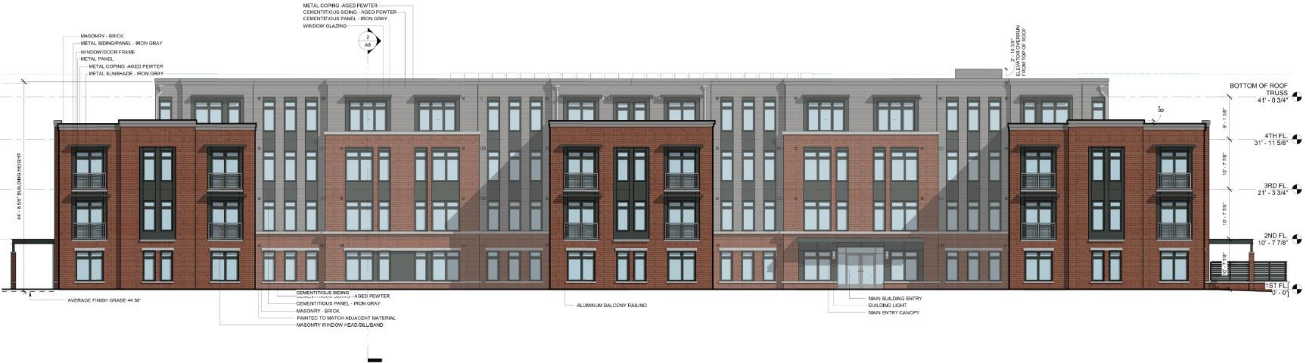
1 NORTH PATRICK STREET ELEVATION 15 1/8" = 1'-0"