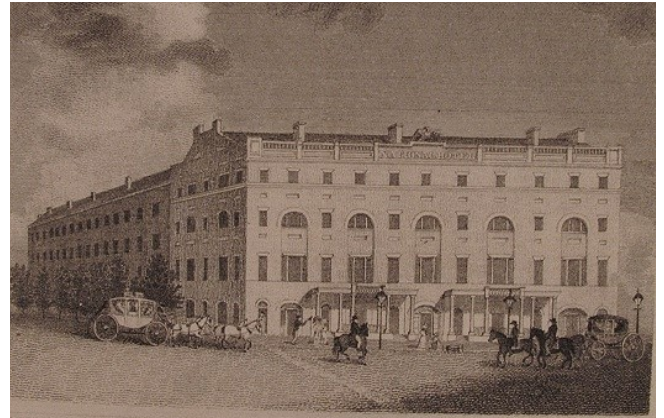
The National Hotel. It was demolished in 1942.

The National Hotel was the temporary home to President-Elect Andrew Jackson when he arrived in Washington on February 12, 1829. He stayed in a suite of rooms where he worked on selecting his Cabinet. After his inauguration at the Capitol on March 4, Jackson hosted a large celebratory party at the White House. Things got out of hand quickly, (legend has it thanks to some alcoholic punch), with Jackson escaping from the White House and returning to his room at the National Hotel.