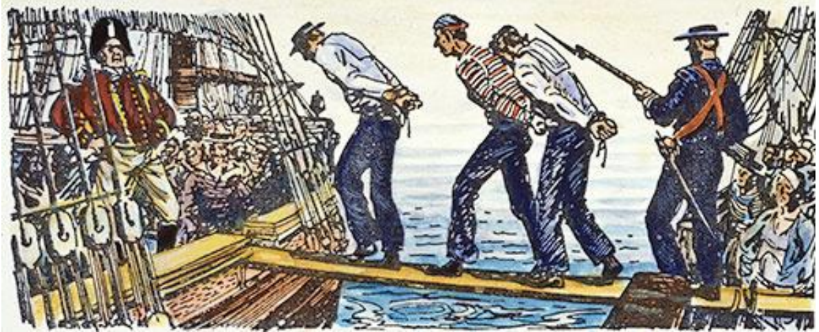
NATIONAL MARITIME HISTORICAL SOCIETY