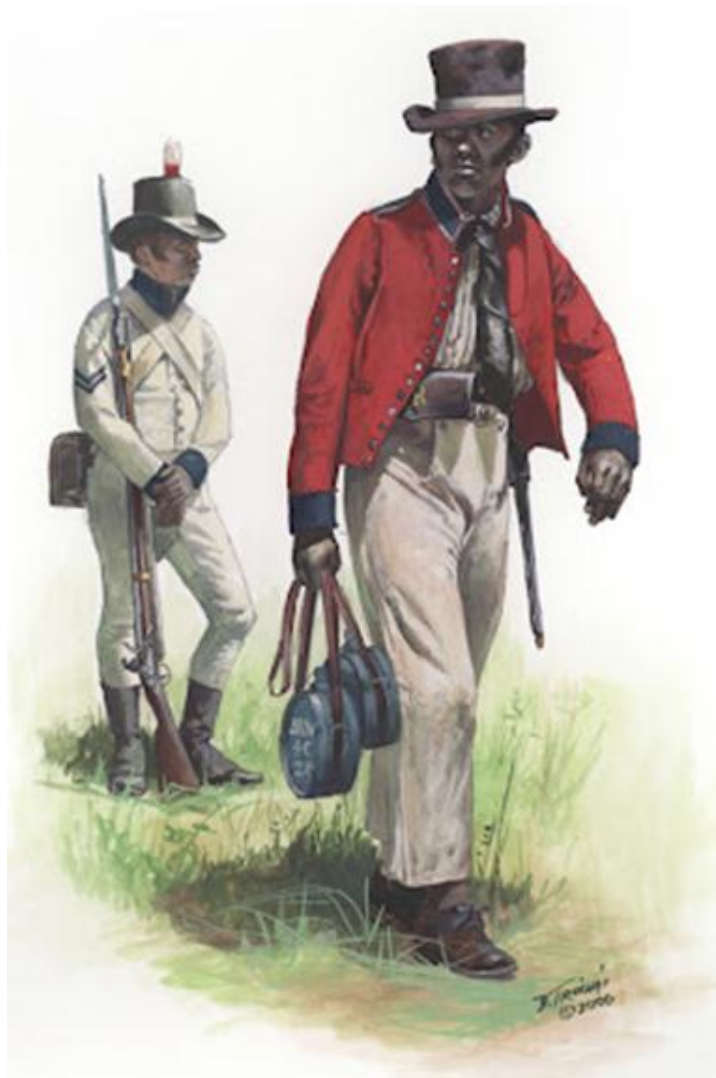
PAINTING BY DON TROIANI, WWW.HISTORICALARTPRINTS.COM

As this proclamation indicated, the British enlisted black male escapees into a British fighting force called the Colonial Marines. The marines were issued uniforms that included the British red coat and were trained at a fort established on Tangier Island in the Chesapeake Bay. Once trained, the new marines became a valued part of British raiding parties.