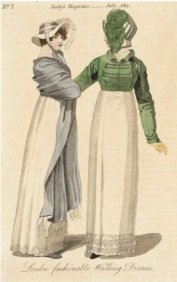
A fashionable lady's walking dress, circa 1812-1814.