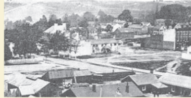
"On New Year's Day, West End is waked up-it becomes an institution.. men, women and children, mechanics, field hands, dining room servants.. eating drinking fiddling and dancing; all their own masters, so far as having the privilege of selecting their homes for the next year goes.. HIRING OUT DAY-January 1st of every year." Employees came from the surrounding counties to hire African Americans for field, manufacturing, service and domestic jobs until the Civil War in 1861. Slough Hospital, a Union Civil War hospital, and Hunting Creek are in the background. Alexandria Gazette, January 14, 1860.