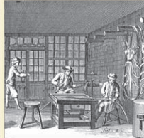
A Detroit Pictorial Encyclopedia of Trades and Industries , Dover Publications, 1987; Farewell Sentinel , Vol.III, No. 1.

"West End-a village joining this city and separated from the Corporation limits by Hooff's Run, is a very old place. . . We have heard old people say, that they remembered when West End, was, in one sense, "a shipping port."-for that they have seen a flat bottomed boat come up Hooff's run to the Stone Bridge, land oysters there, and take on board a return cargo."