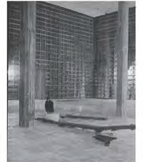
Ice storage house.