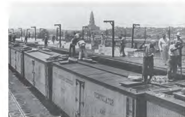
Left: Loading ice into rail cars with perishable goods. Right: Hauling ice with tongs.