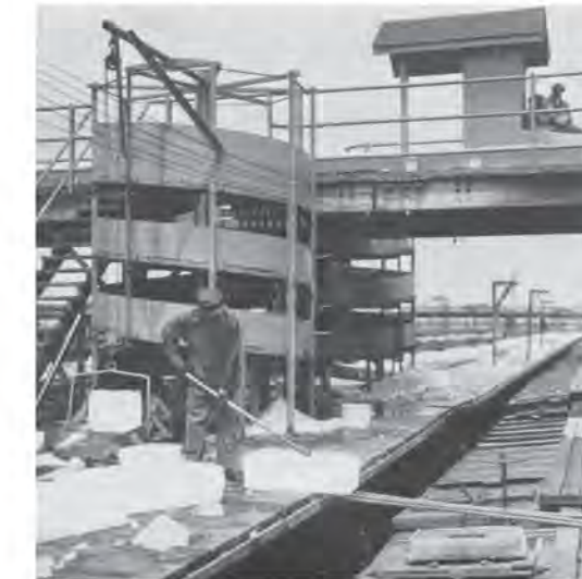
Ice chutes, conveyors, and platforms.

Established in 1900, the Mutual Ice Company stood just east of the Yard and supplied ice for cars carrying perishable items such as meat and fruit. Before the days of mechanical refrigeration, blocks of ice were conveyed from the ice warehouse on overhead platforms and lowered into rail cars through roof hatches. At its peak, Mutual Ice loaded 700 tons of ice onto 500 cars each day. However, the onset of refrigerated cars in the 1950s made icing obsolete and Mutual Ice closed its doors in 1969.