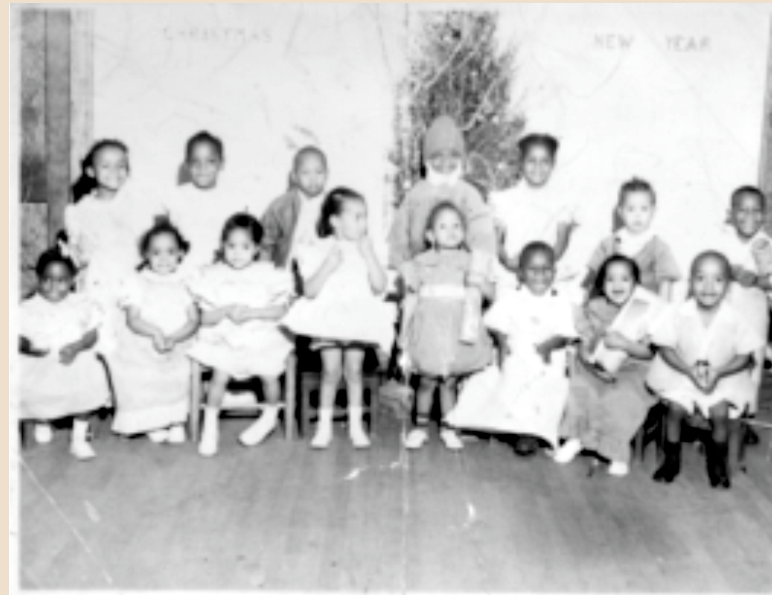
Carver School students take part in a Christmas pageant, ca. 1940s.

This modest, wood-frame building has played an important role in the segregated history of Alexandria. During World War II, the federal government encouraged women to join the war effort by providing safe and affordable day care. In Alexandria, as elsewhere, racial segregation was the norm; the Carver School was completed in 1944 and operated as a segregated nursery school for children of African American war workers. After the war, federal support for day care ended but Alexandria's working mothers lobbied the city to keep the nurseries open. The city agreed to operate two white nurseries and the Carver School, but doubled the monthly fees to $27. In the black community, social clubs helped fund Carver students. The nursery ultimately closed in 1950 and the building then served as a segregated American Legion post. By 2010, the building was vacant and neglected and came close to demolition. It was finally preserved and adaptively reused in 2014.