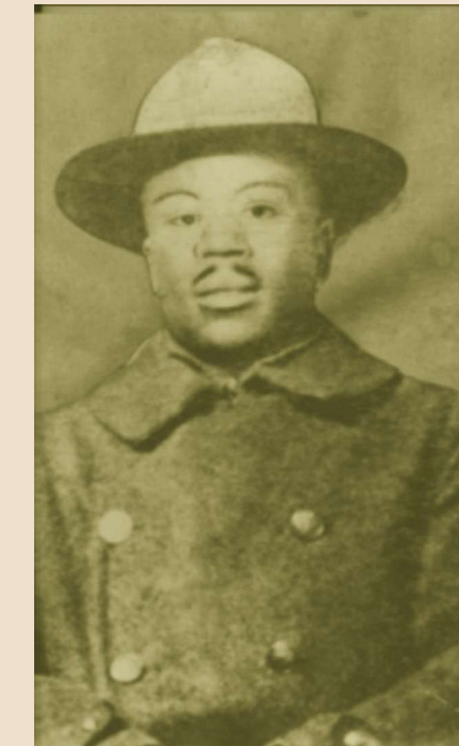
William Thomas, ca. 1917