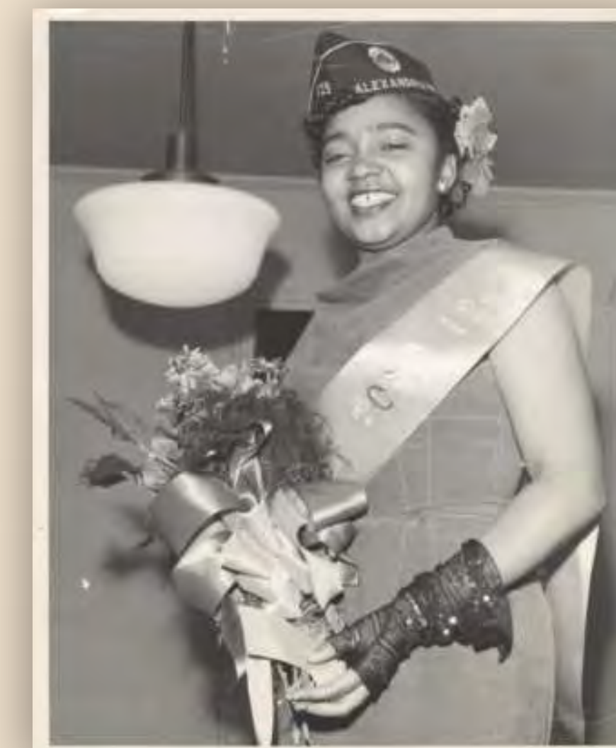
Post 129 beauty contest winner, ca. 1950s