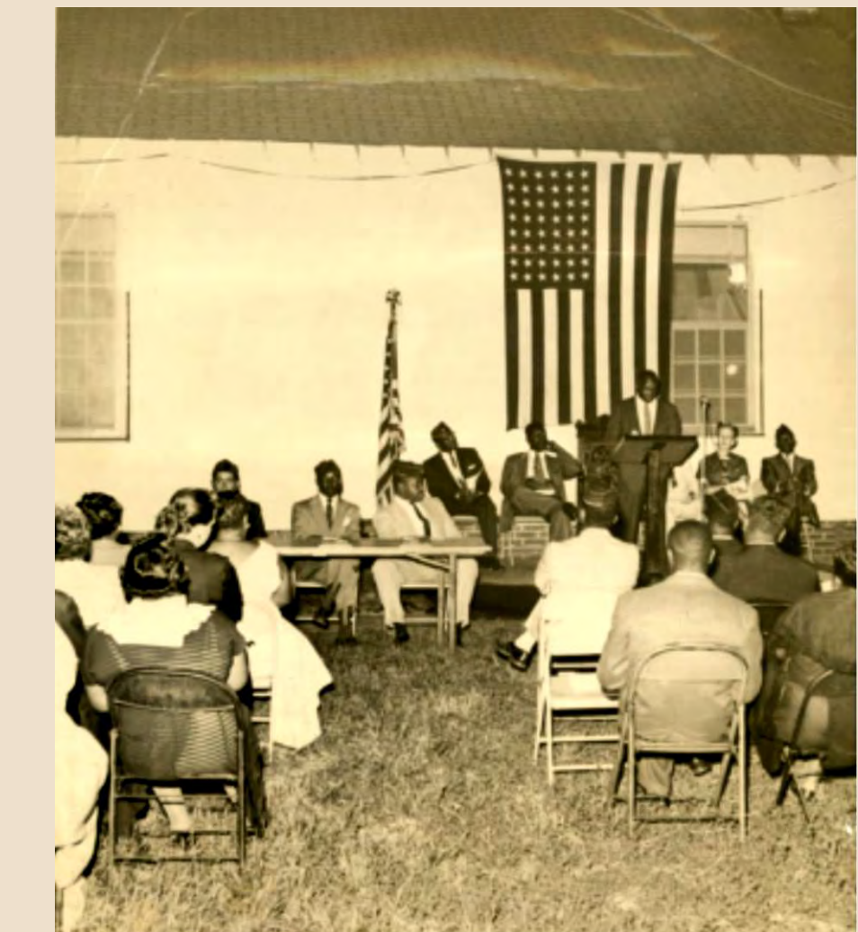
Post 129 members meet outside during the summer, ca. 1950s.