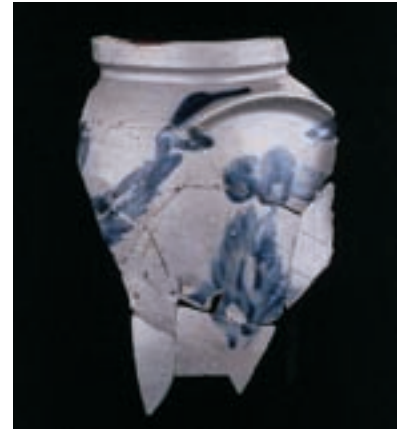
Figure 6 Jar, Tildon Easton, Alexandria, Virginia, 1841–1843. Salt-glazed stoneware. D. (of rim) 7". This example shows the typical squared rim and lug handle. Leaves surround the ends of the lug handle springing from a garland of leaves, and the typical Easton flower appears on the front and sides.

Five-petal flowers (fig. 7) are found on only two vessels. On the example shown, this flower is centrally placed on the front of the milk pan, with branches on either side. The second flower's petals are closer together and more tuliplike, but the flower's placement cannot be determined from the small fragment. One fragment from the Wilkes Street pottery has a four-petal flower similar to this.