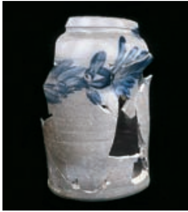
Figure 5 Jar, Tildon Easton, Alexandria, Virginia, 1841–1843. Salt-glazed stoneware. H. 10". The placement of the flowers in line with the foliage is less common.