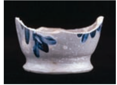
Figure 7 Milk pan, Tildon Easton, Alexandria, Virginia, 1841–1843. Salt-glazed stoneware. D. 8". The five-petal flower has been found on only two vessels.

Figure 8 Milk pan, Tildon Easton, Alexandria, Virginia, 1841–1843. Salt-glazed stoneware. D. 11". Flowers appear at the ends of the side branches in this forward-facing design.