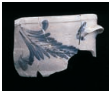
Figure 2 Milk pan, Tildon Easton, Alexandria, Virginia, 1841–1843. Salt-glazed stoneware. D. 10". This milk pan shows the typical squared rim, pouring spout, and lug handle. A version of the three-petal tulip is seen under the spout. Also under the spout is the mark “TILDON EASTON” stamped with 16-point metallic type. (All objects courtesy Alexandria Archaeology; photos by Gavin Ashworth unless otherwise noted.)

More than half of these sherds were of salt-glazed stoneware. The impressed mark “TILDON EASTON” appears on twenty vessels from the waster pile, including an ovoid flask, three jugs, two bottles, two smaller bottles, and eight cobalt-decorated milk pans (fig. 2). Four milk pans have one-and-one-half-gallon capacity marks. The same mark appears on two earthenware milk pans.