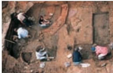
Figure 1 The base of Tildon Easton's stoneware kiln in Alexandria, Virginia, excavated in 1984 by the city archaeologists. The updraft kiln, built in 1841, measures 12' across. Volunteers are excavating the waster dump, lower right. The adjacent well (at bottom) is of a later date.

Tildon Easton's pottery kiln was excavated in 1984, but recent information from a descendant of the potter and the Alexandria Archaeology Museum's revived focus on locally produced pottery have led to a new look at Easton and his wares. In particular, we have begun to look at ways in which Easton's pottery might be differentiated from other Alexandria stoneware.