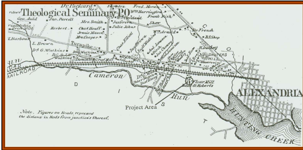
1879 Hopkins Map of Project Area