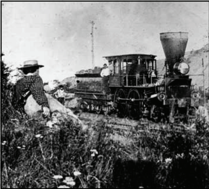
Locomotive on the Orange & Alexandria Railroad, Virginia (1862)

1866, the Alexandria Water Company rerouted its intake canal to cross the lower part of the mill property. Phoenix Mill's tailrace now emptied into the Water Company canal rather