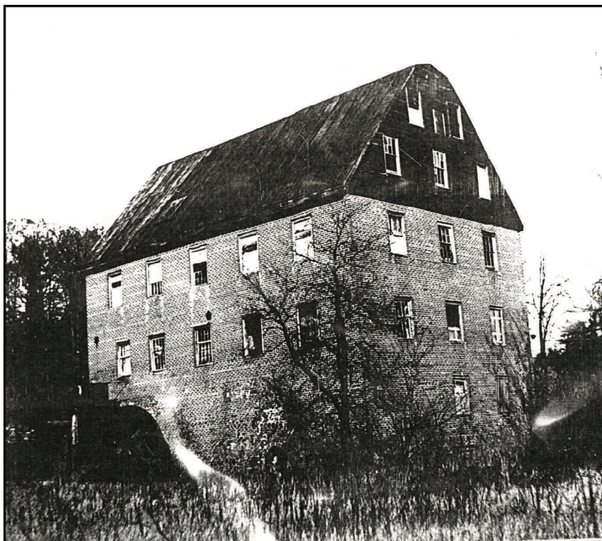
Above: Undated mid-nineteenth century photograph of Phoenix Mill building, mistakenly labeled as Cloud's Mill

Siena Corporation recently purchased the Phoenix Mill building. They plan to adaptively reuse the mill building, removing the non-historic additions and adding landscape elements that will echo the building's historic past as a grist mill. The mill will again be a reminder of the milling industry that flourished along the banks of Cameron Run less than a century ago.