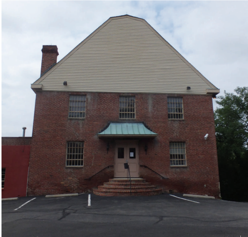
Modern view of Phoenix Mill building (Siena Corporation)

L ocated along Wheeler Avenue in Alexandria is a tall, unassuming brick building with a high-peaked roof. The building's unique many-paned windows hint that the building may be more than it looks. Built in 1801, the building is the last standing grist mill in the City of Alexandria. The four-story brick structure replaced an earlier mill that had burned to the ground in exactly the same spot just months before.