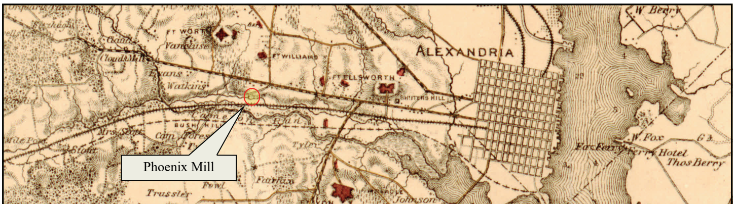
Detail from US War Department (1865) Military Map of NE Virginia, showing Forts and Roads