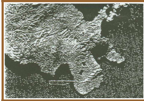
Fabric pattern impressed on lead

The two slate pencils recovered were used more as scribes, sharp tools used for marking wood, metal, or ceramics, than as pencils as we think of them today. One of the pencils apparently was dropped during construction of the chimney as one side is covered in mortar. Another item similar in size and wear patterns to the slate pencils is a small worked bone (pig fibula). Most of the pieces of lead recovered are small, and the fire that destroyed the structure melted all of them. The one large, 5.9-ounce pool of lead was either contained in a cloth bag or melted onto a piece of cloth. The fabric impression on the backside of the lead is similar in texture to a flour sack. The original use of the lead is unknown. It may have been a lead seal or a small collection of bullets.