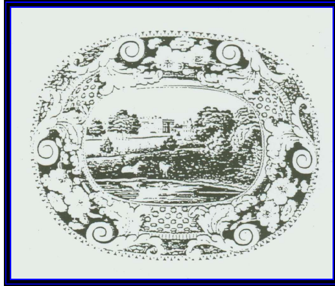
"Large Scroll Border Series" Platter dated from 1813 to 1829