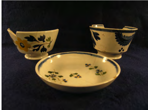
Fig. 7: Pearlware tea cups and saucer, AX 1 Ft.5

A few of the artifacts found in the privy are illustrated below (all artifact identifications were made by Barbara H. Magid, Alexandria Archaeology). Figure 7 features two so-called London-shape teacups and a saucer. The two pearlware cups were hand painted and produced some time around the 1810's and 1820's. The saucer, also a pearlware hand painted item, could have been manufactured any time between 1795 to 1830. Figure 8 features a whiteware London-shaped bowl, produced sometime between 1830 and 1860.