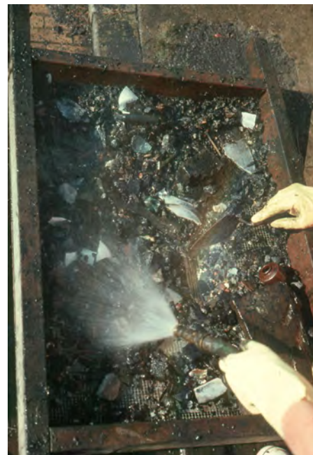
Fig. 6: Screening for artifacts