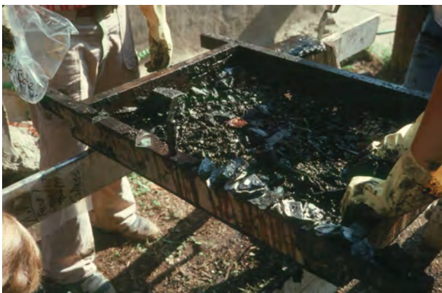
Fig. 5: Screening through the muck (ALEXANDRIA ARCHAEOLOGY COLLECTION)

Artifacts of all sorts were found in the airless, water-logged environment of the privy. Not only were there quantities of ceramics and glass, but faunal, floral, and other organic remains were also preserved extremely well in these ideal conditions.