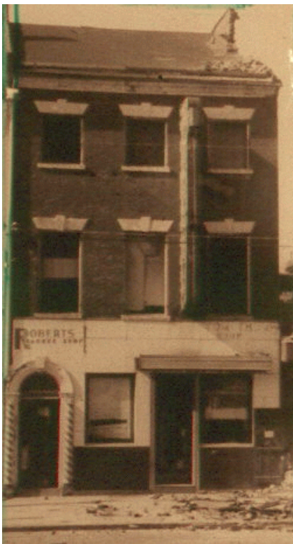
Fig. 2: 522-524 King Street in 1967

In 1835, McKenzie moved into the second and third floors of the house at 522-524 King Street and remained there with his family and two slaves until 1843 (Fig.2).