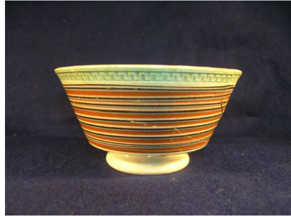
Fig. 8: Whiteware bowl, AX 1 Ft.5 (ALEXANDRIA ARCHAEOLOGY COLLECTION)