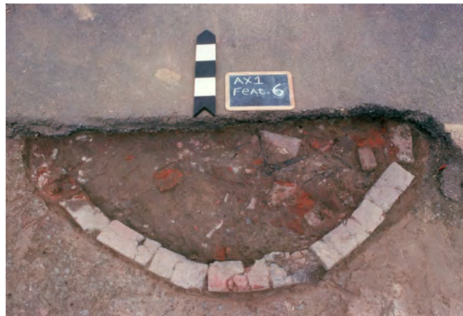
Fig. 3: Top of Feature 6

Within the first few weeks of beginning the excavation, the remains of a well were discovered in the area that was once the backyard of the house (Fig.3). See Site Map Unfortunately, half of the well was covered with asphalt from the area of the parking lot that archaeologists were not yet allowed to dig (see Project Overview). Because of this, field workers had to wait almost a month before being able to uncover and excavate the entire feature (designated Feature6). Work on the well finally began in August of 1977. The brick-lined structure averaged