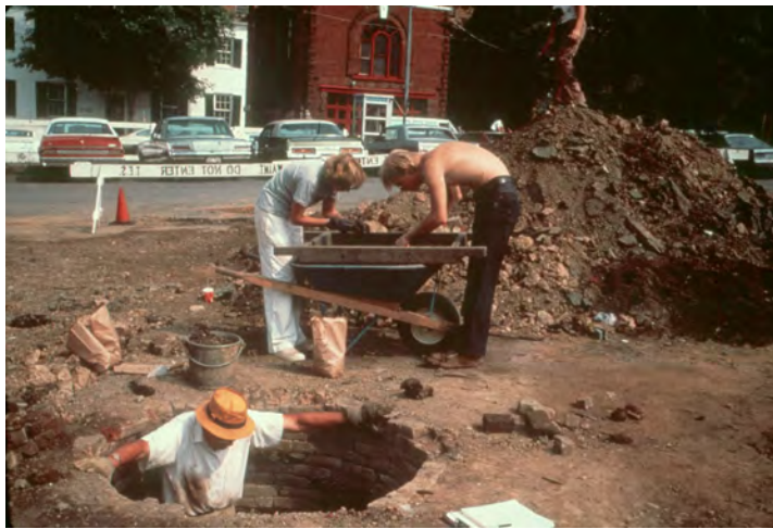
Fig. 4: One volunteer excavates Ft 6 while two others screen the dirt for artifacts

about 6.5 ft. in diameter and was excavated to a depth of almost 25 ft. Originally it would have been slightly deeper, as a few of the top brick courses seemed to have been scraped off when the site was graded after demolition.