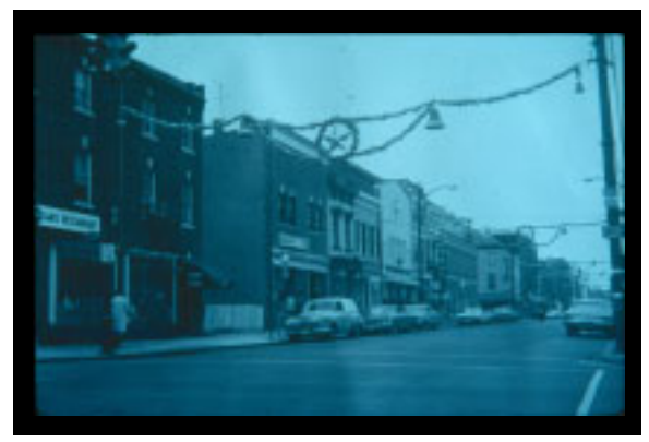
King Street during the Christmas holidays (circa 1950's).

leader with the jewel in his navel, swinging his scimitar menacingly from side to side in time with the music and glowering at us kids? Toward the end of the parade always came straggling, unruly groups of Cub Scouts supervised by unsmiling adults wearing a look of resignation. Fire engines from all the neighboring districts brought up the rear, and we all delighted in seeing Smokey, the mascot of No. 2 station in Alexandria, standing in a dignified pose atop their gleaming red pumper.