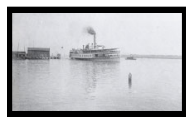
The Norfolk and Washington Steamboat Companies provided services to Alexandria through the early 1950's.

actually lived in houseboats on Hunting Creek near the site of Hunting Towers. The Wilson Line did provide a pleasant sight as its cruise ship wandered slowly down to Marshall Hall and Mount Vernon each summer evening until it finally sank after some years. At night, provided that the tide was not out, it could be delightful to walk along the river. We used to enjoy eating outside with our parents on the high terrace of the Beachcomber Restaurant, now an arms dealer, at the foot of Prince Street. The lights on the Maryland shore were few, and the silence was broken only by the distant hum of the infrequent cabin cruiser passing by with its bluegreen and red navigation lamps glowing in the deep darkness. The rhythmic lapping of the small waves onto the riverbank was just about the only other sound, since there was no Wilson Bridge then with its noisy trucks. Air traffic was just beginning to increase from National Airport, but the sight of aircraft taking off at night was unusual. I can barely recall the sight of seaplanes, bobbing on their pontoons, tied up at the old ferry dock on Strand Street where the Norfolk-Washington steamboat used to call.