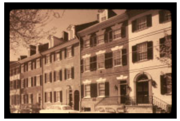
The 200 Block of Prince Street, North side.

Fire alarms in town used to save us from many an otherwise dull afternoon and provide us with free entertainment. If we were in the midst of a ball game, we would drop the ball and bat and take off running after the engines. There used to be block after block of wood frame dwellings with bay windows and round cupolas through Old Town, and they tended to burn furiously, with clouds of smoke that were visible blocks away. More often than not, though, the calls turned out to be something trivial. We watched with morbid fascination as the firemen sprayed down people's smoldering mattresses, sofas, and other personal possessions which had been hauled out on the sidewalk for a thorough dousing. Alarms were always an excuse for an impromptu gathering of neighbors, too, who stood in robes and hair curlers in small groups and exchanged local gossip after the excitement died down.