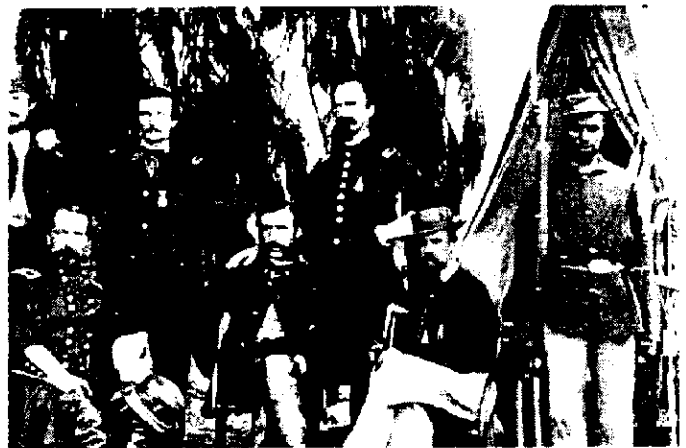
Brig. Gen. Edward Ferrero commanding all-black Fourth Division, Ninth Army Corps, and staff at Petersburg, June or July, 1864.

Because the Bureau for Colored Troops was not established until 22 May 1863, there were exceptions to the control and designation of black regiments. The officers of the Fifty-fourth and Fifty-fifth Regiments of Massachusetts Volunteers (Colored) were appointed by the governor and these regiments retained their regimental numbers through the war. The Fifth Massachusetts Cavalry Regiment (Colored) kept its state number, but it is not certain that the governor appointed officers in the same manner as was done with white regiments. The Twenty-ninth Connecticut Volunteer Infantry (Colored) was the fourth and final exception to the USCT numbering system, and some regiments