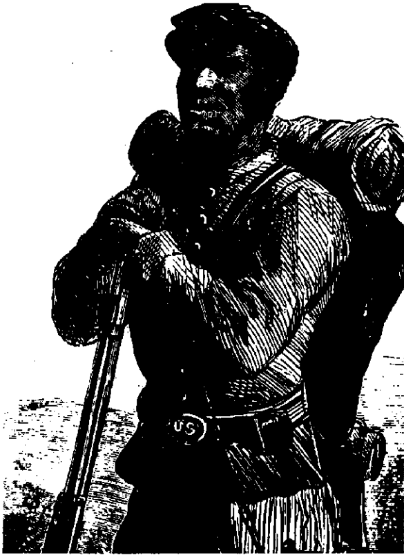
A typical black soldier ( Harper's Illustrated , 2 July, 1864)