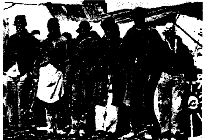
"Contraband" Laborers.

Like Arlington Cemetery, The Alexandria National Cemetery was begun during the Civil War when Washington was on the front line between Union and Confederate territories. At that time, Alexandria was a major Union Army supply center and the site of many army general hospitals to which sick and injured soldiers were evacuated from battlefields and camps in the field. Alexandria medical facilities eventually provided the Union Army with 6,500 beds. Death rates were high from combat wounds and disease. Most casualties were from illnesses which were often caused by the imperfectly understood consequences of poor sanitation. In those days, the dead soldiers' bodies were not returned to relatives at government expense, instead, the army had to find a burial place for them.