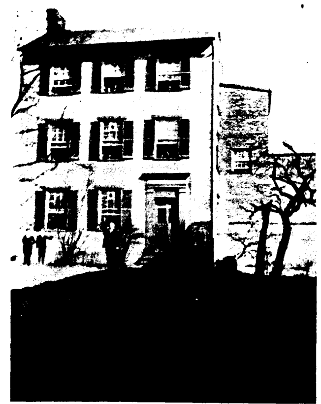
Alexandria Academy in a photograph taken around 1885.

their Children should associate with those of a lower class. This operates against the Washington School, and prevents its increase."** Recognizing the need to provide free education for the poor did not mean granting poor children access to the same education received by paying students. British education reformers noted that-"At present it is necessary that the education of different ranks should, in some respects, be different. They have few ideas, few habits, in common: their peculiar vices and virtues do not arise from the same causes, and their ambition is to be directed to different objects. But justice, truth, and humanity are confined to no particular rank, and should be enforced with equal care and energy upon the minds of young people of every station."23