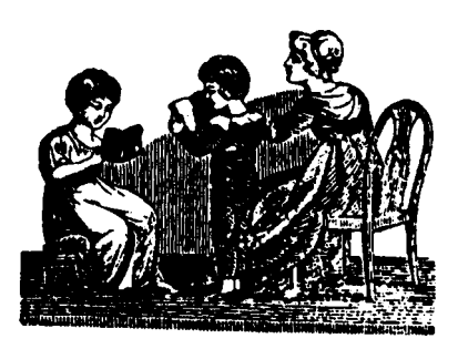
Illustration of a dame school from the Boston Type and Stereotype Foundry Catalog, 1832.

After a few years in a dame school, a young lady could progress to a more varied curriculum offered by teachers specializing in the useful and ornamental branches. Part two will continue with a discussion of this aspect of female education and the seminary movement that commenced in Alexandria during the 1820s.