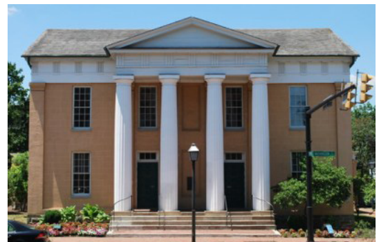
The Lyceum, 201 South Washington Street.