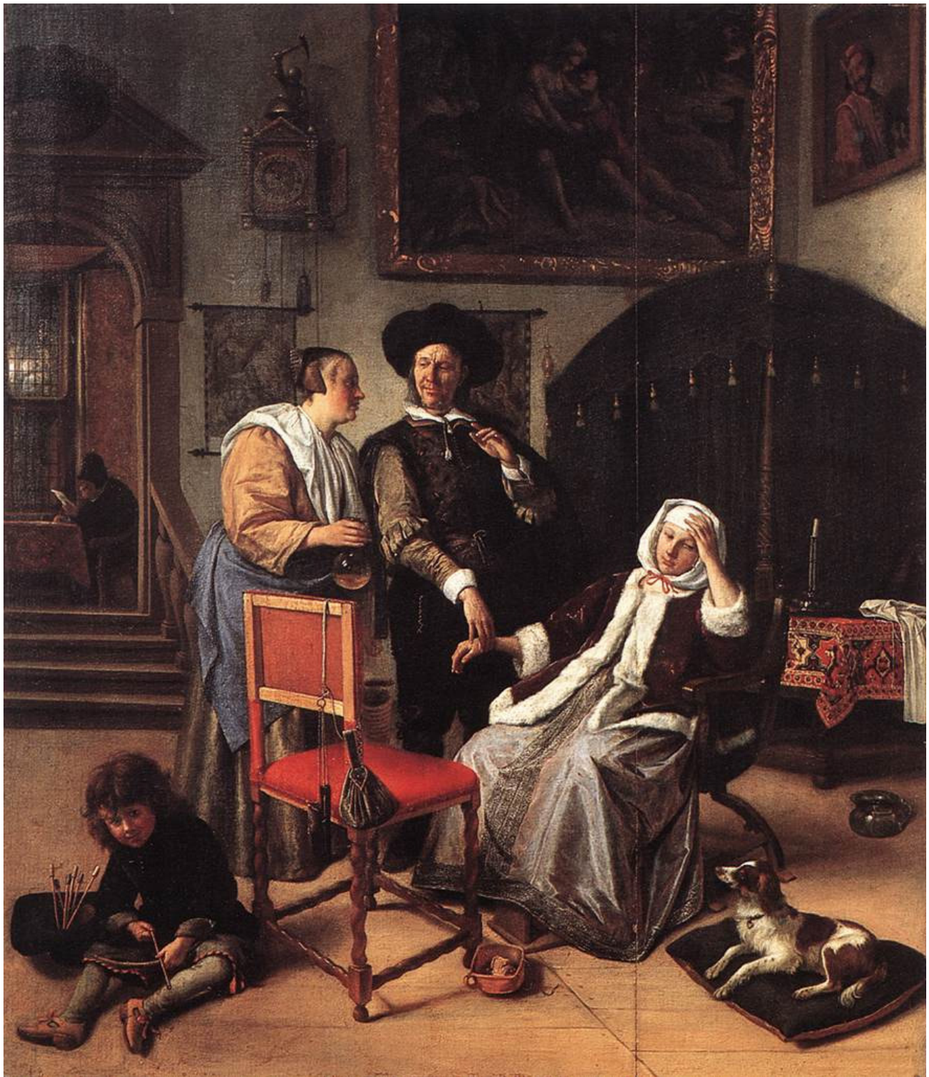
Jan Steen, The Physician's Visit, ca. 1655, Collection of the Wellington Museum