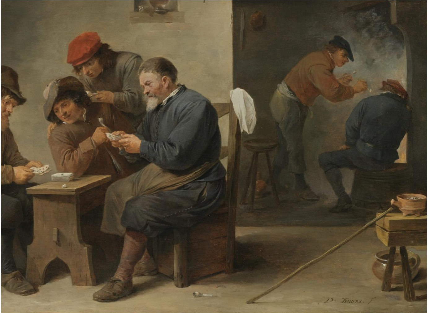
Teniers, David. A Tavern Interior with Peasants Playing Cards . ca. 1644-5, Private collection.

Historical records like maps, photographs, newspapers, land and tax records, letters, and artwork can show what life was like in the past. These paintings and illustrations show everyday objects, including chamber pots. Can you spot the pot in each image below? Check your answers on the last page. Hint: Chamber pots were often kept on the floor and were emptied outside after being used.