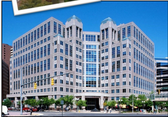
NSF's current Ballston headquarters-- Stafford Place

The NSF moved to the Ballston neighborhood in Arlington in the early 1990's and currently occupies more than 570,000 SF in two adjacent office buildings -- Stafford Place I and II, located on Wilson Boulevard across from the Ballston Mall. NSF is considered to be one of Ballston's anchor office tenants, and a critical piece of Arlington's brand for that area.