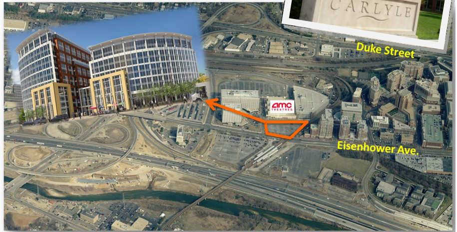
NSF's future Eisenhower Avenue headquarters-- Hoffman Town Center