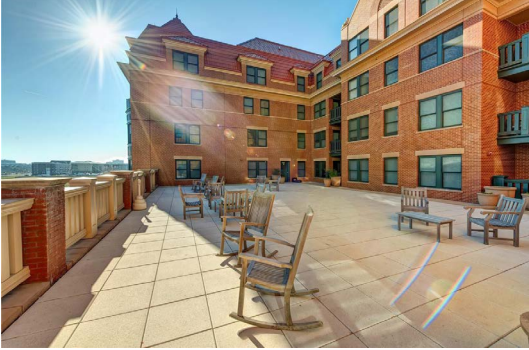
The Station at Potomac Yard residential units amenity area above the Fire Station below.