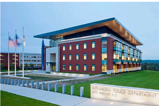
The Alexandria Police Headquarters 3600 Wheeler Ave