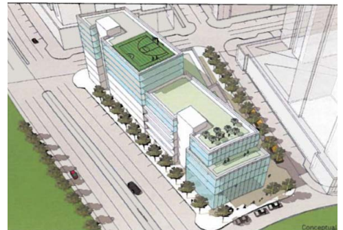
Block 4 - Urban School Co-location Yield Study