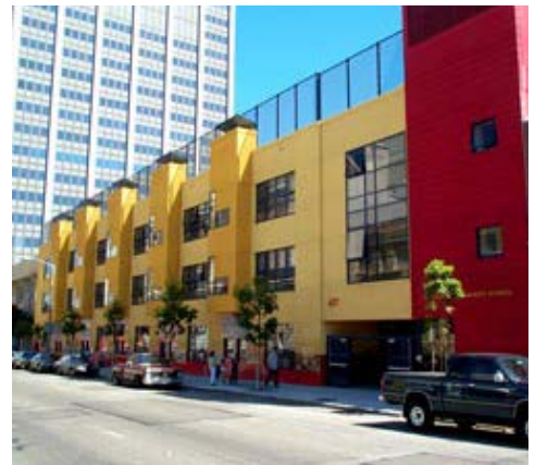
Urban School Precedent: Tenderloin Community School, Children's Center & Community Services Facility