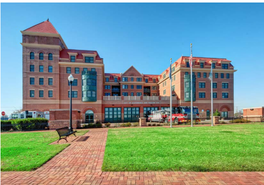
Potomac Yard Fire Station 2800 Main Line Boulevard