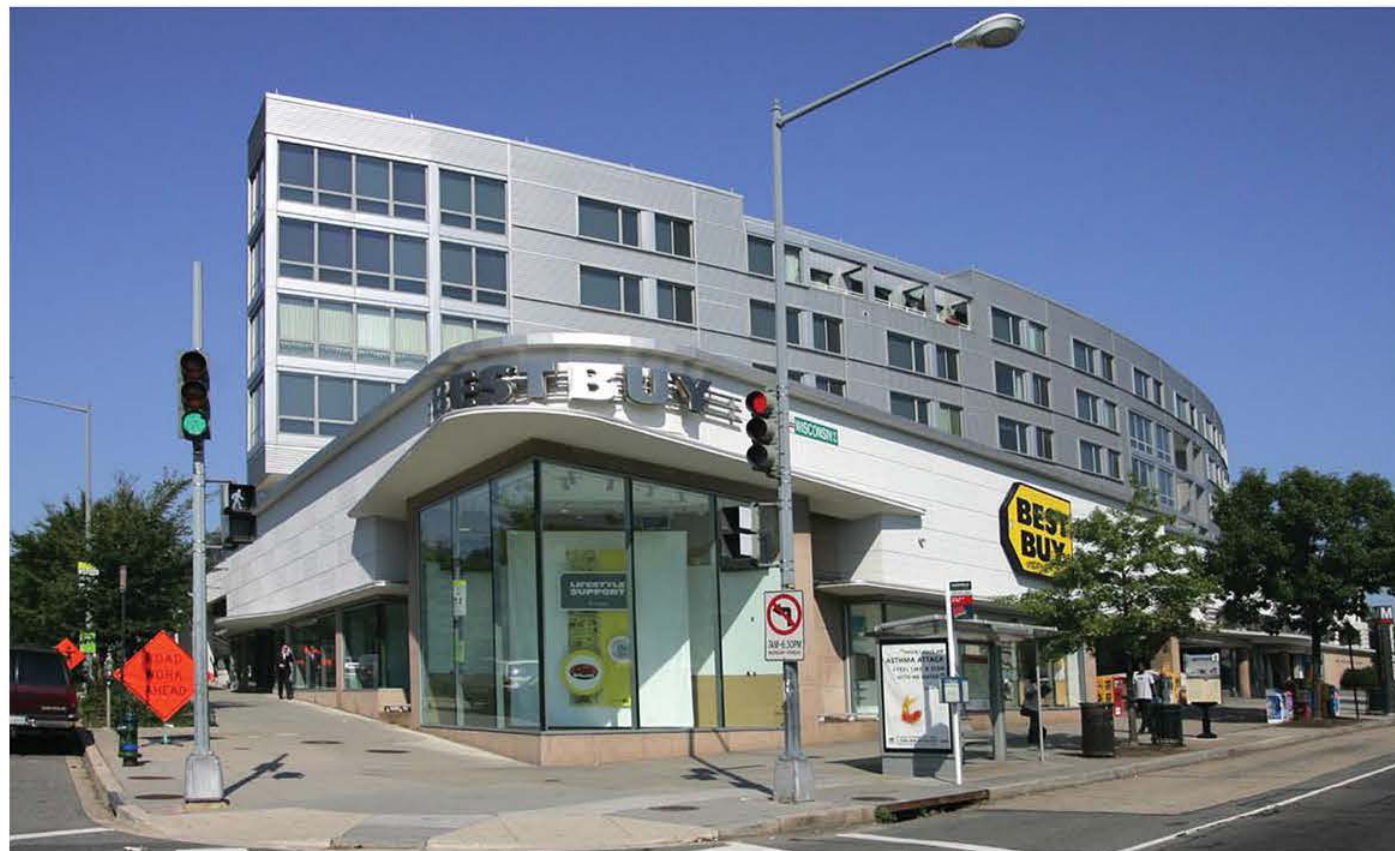
BEST BUY , 4500 Wisconsin NE, Washington DC