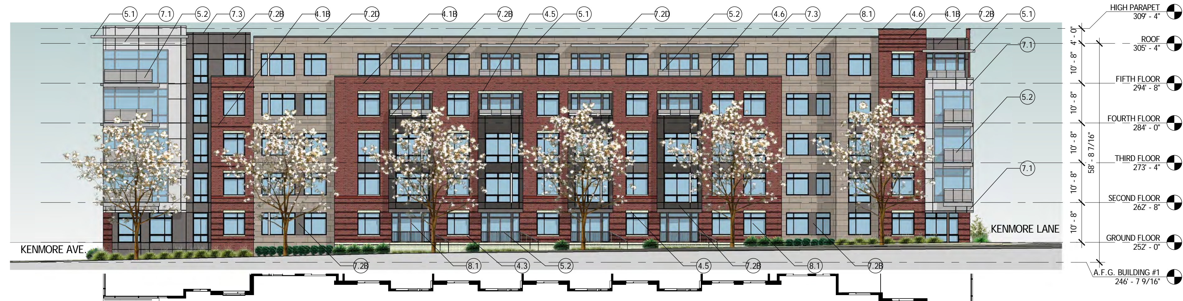
9A LANDBAY A - EAST ELEVATION A2.1 | A4.0 | 1/16" = 1'-0"

NOTE: COLORS SHOWN ARE FOR CONCEPTUAL PURPOSES ONLY, SUBJECT TO VARIATION