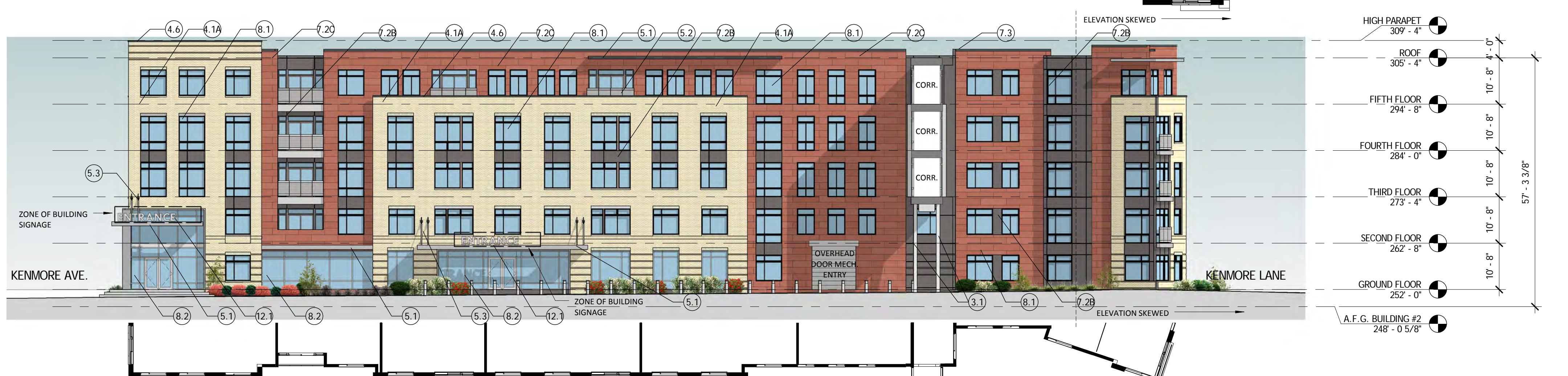
9A LANDBAY A - PRIVATE ROAD A - WEST ELEVATION

NOTE: COLORS SHOWN ARE FOR CONCEPTUAL PURPOSES ONLY, SUBJECT TO VARIATION