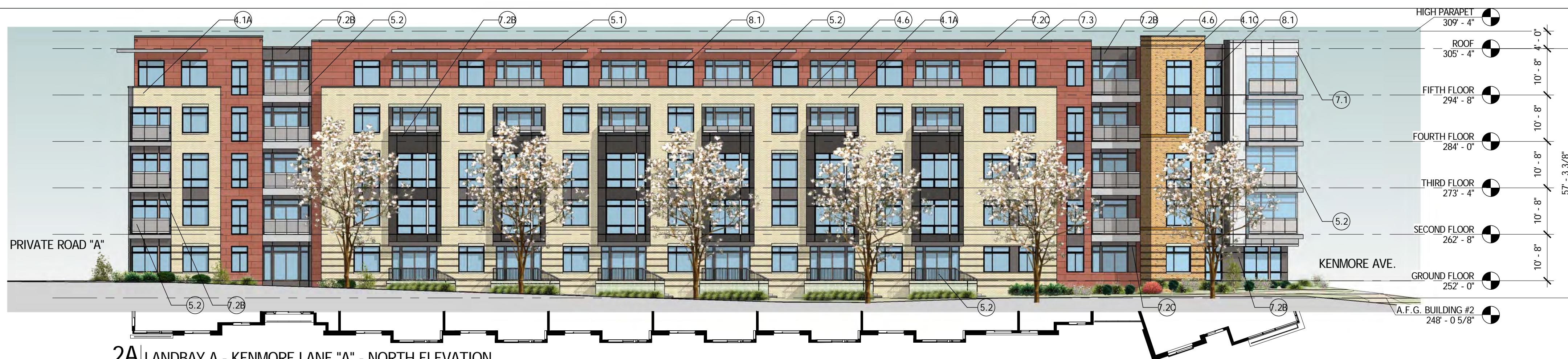
2A LANDBAY A - KENMORE LANE "A" - NORTH ELEVATION