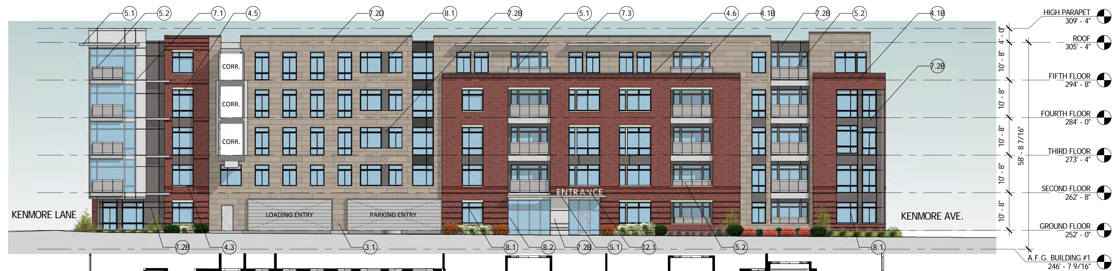
4A LANDBAY A - PRIVATE ROAD A - EAST ELEVATION A2.1 | A4.0 | 1/16" = 1'-0"