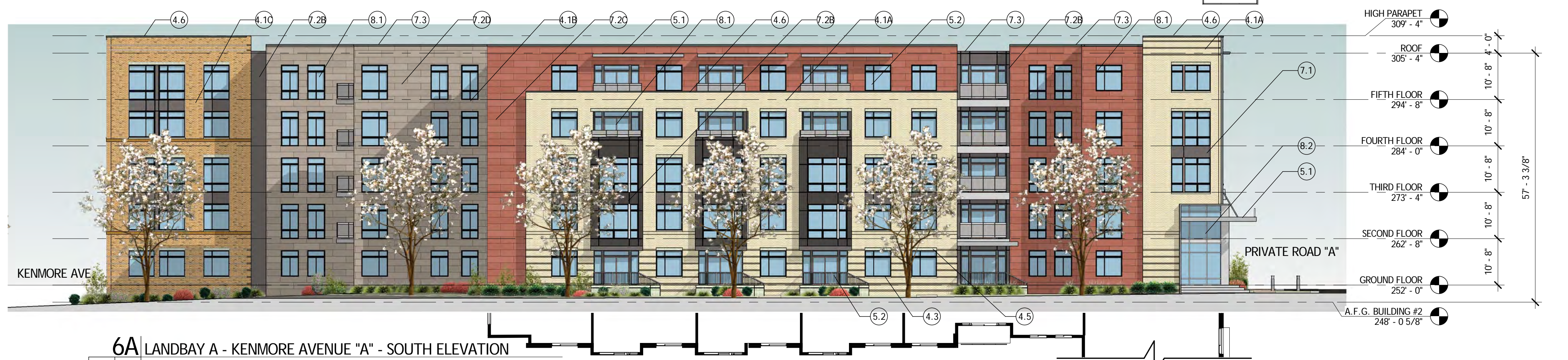
6A LANDBAY A - KENMORE AVENUE "A" - SOUTH ELEVATION