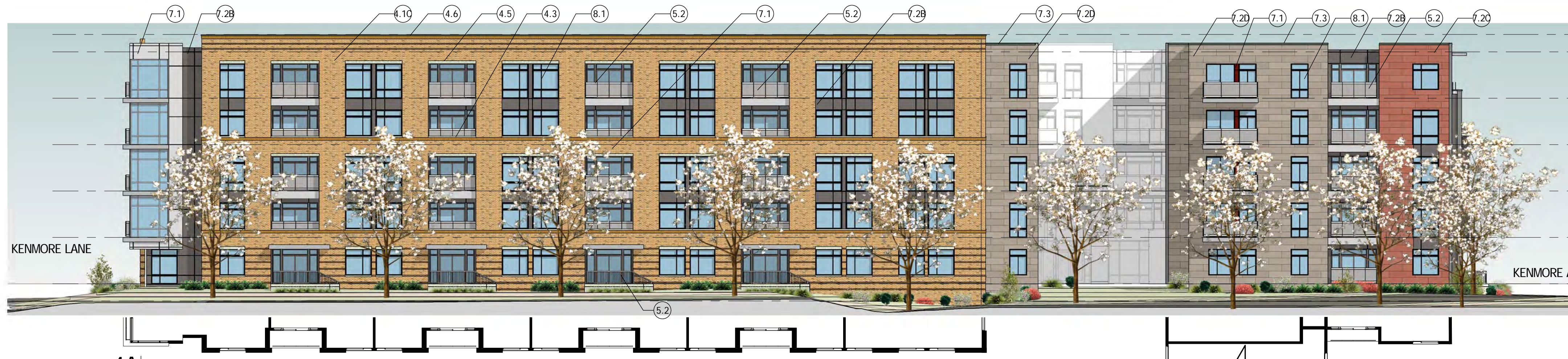
4A LANDBAY A - WEST ELEVATION