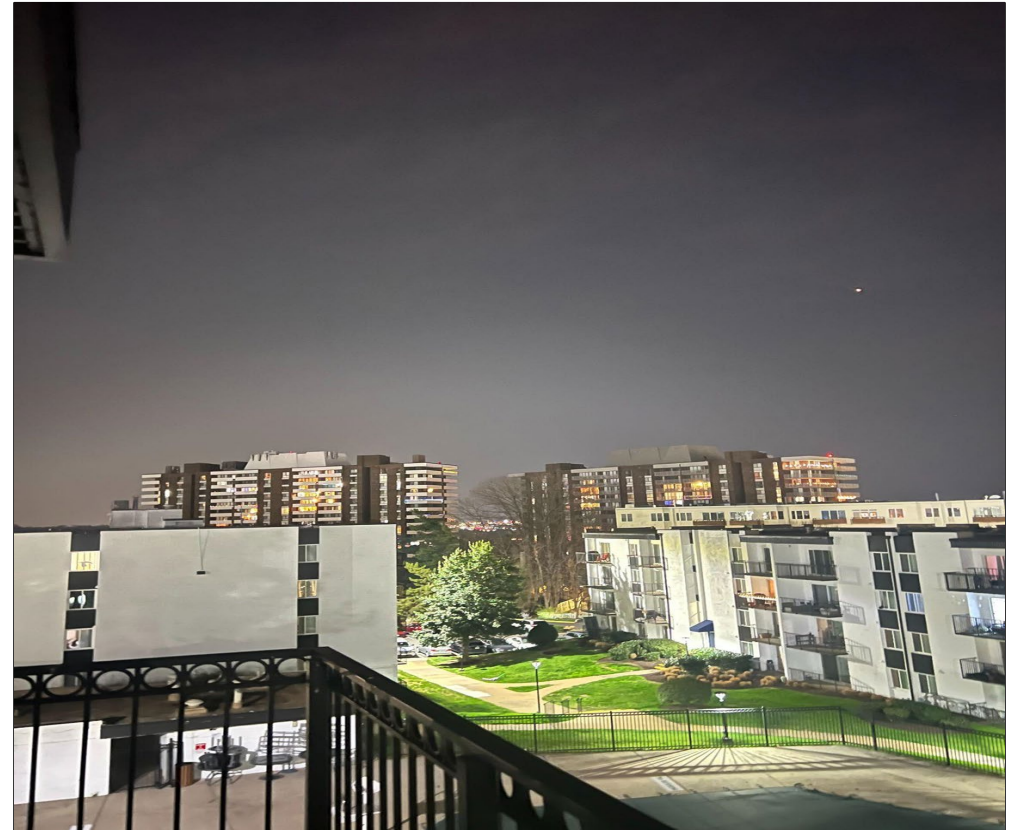
This picture was taken by Yalda Hamidi.

My photo shows my neighborhood at night with buildings and lights. I see apartment buildings, lights in the windows, trees, and a small green area. This picture makes me feel calm and happy because it looks quiet and safe. This picture is important because it shows my neighborhood and where I live.