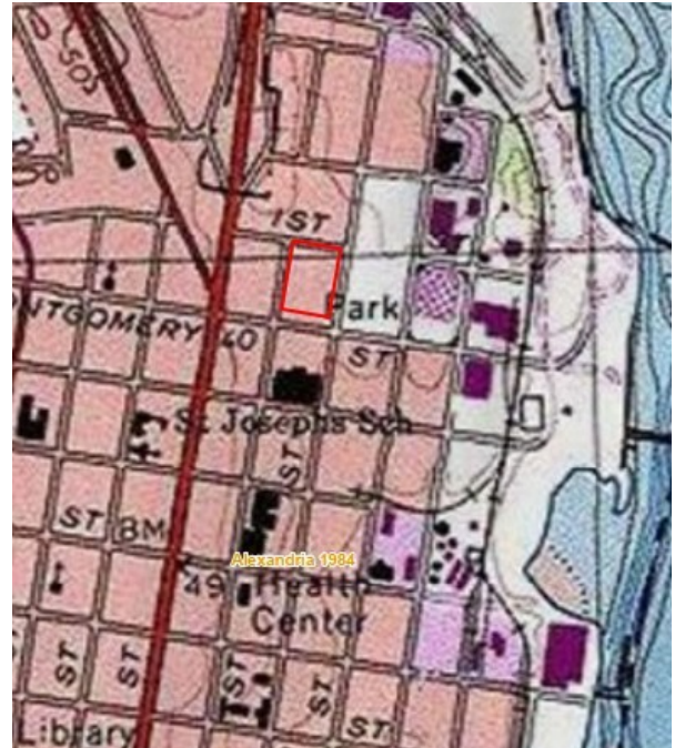
USGS (1983, photo revised) 7.5' topographic map showing the location of the Project Area.

Historically, Block 311 was left undeveloped until 1840, when both lots were purchased by the Alexandria Canal Company. The Block was to become the location of a turning basin at then eastern end of the Alexandria Canal. Construction of the turning basin was completed in 1843 and served an important link between the C&O Canal and the Potomac River wharves for the next 41 years. When the canal closed, the property was once again sold and by 1949-1950 commercial properties occupied both lots with the southeast portion of Lot 2 being the only open space. By 1969, Lot 2 was redeveloped and the Virginia ABC Store and offices were opened.