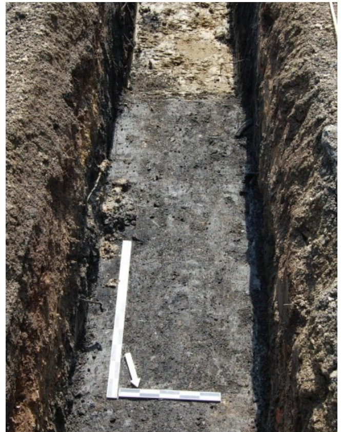
The canal surface within the turning basin as seen in the northern portion of Trench 2. The surface was visible approximately 4.5 feet below surface.

The trade offered by the canal spurred the establishment of businesses hoping to profit from proximity to the canal. Within the Project Area, Emanuel Francis built a lime kiln by 1868 on land he leased along the southern edge of the canal basin. Little is known about the kiln, except that it was reported that it was built close enough to the canal that limestone could be thrown from the boats directly into the new kiln.