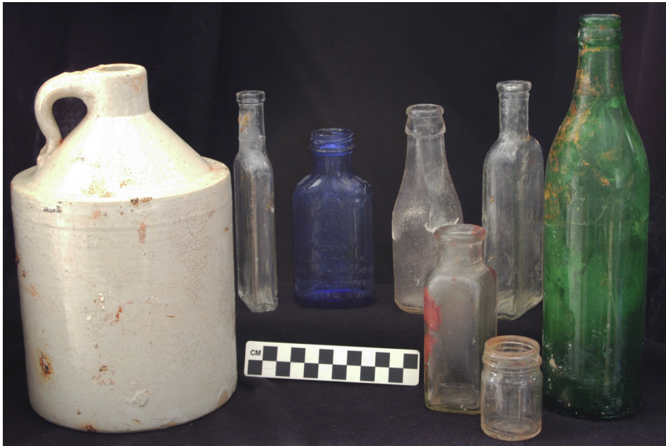
Example of some of the bottle recovered from the twentieth century fill found across the Project Area. Most of the bottles dated from ca. 1938-1942 and represented common consumer products from the first half of the twentieth century.