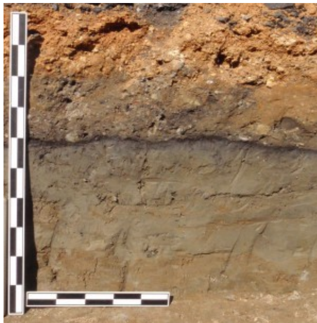
Detail of puddling layer within the central portion of Trench 1

The lower extent of the Alexandria Canal turning basin was uncovered in Trenches 1, 2, 5, and 6. Elements of the canal prism (the watered channel of the canal) and the northern berm of the turning basin were identified. At the surface of the prism, a thin lens of dark, organic soil indicated that the basin was left open after its abandonment and plant growth suggested it was no longer filled with water. Clay and sand layers were identified that formed the impermeable lining of the base and sides of the basin. The soils used to construct the canal's sub-structure appear to have been obtained locally. Clay in the base of the turning basin was laid using a puddling process . Puddling took finely chopped clay mixed with water and laid down in a fluid consistency. To retain their moisture and impermeability, the puddling layer was covered with sandy soil. Although the construction was alike to other canals, the number of layers of clay and sand revealed that the