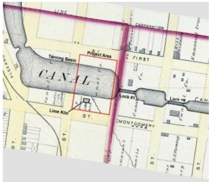
G.M. Hopkins' 1879 Map of Alexandria showing the nineteenth century development of the Project Area.