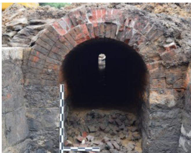
Southern opening of the Spa Spring culvert and the two retaining walls on either side of the culvert opening.

landscape was not ideal for a turning basin and required extensive filling of the natural landscape. Excavation also indicated that mid-twentieth century grading had significantly disturbed the turning basin.