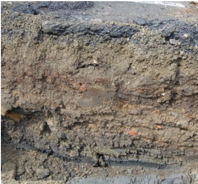
Photo showing layers of twentieth century fill in the Project Area.