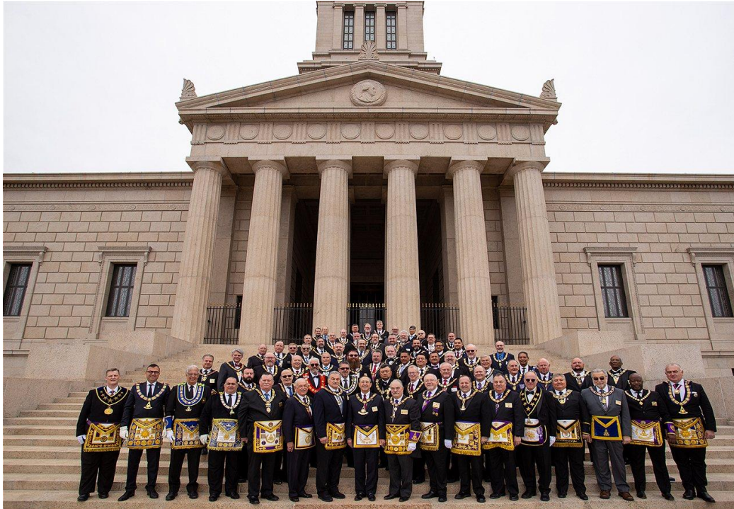
Grand Masters from across the United States.