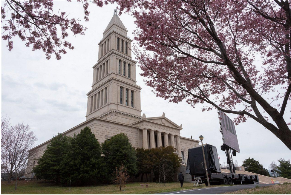
Cherry Trees and setup of Memorial on February 20, 2023.