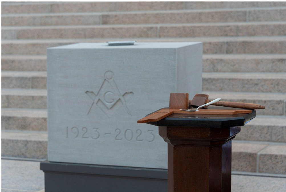
Replica Cornerstone made for ceremony.