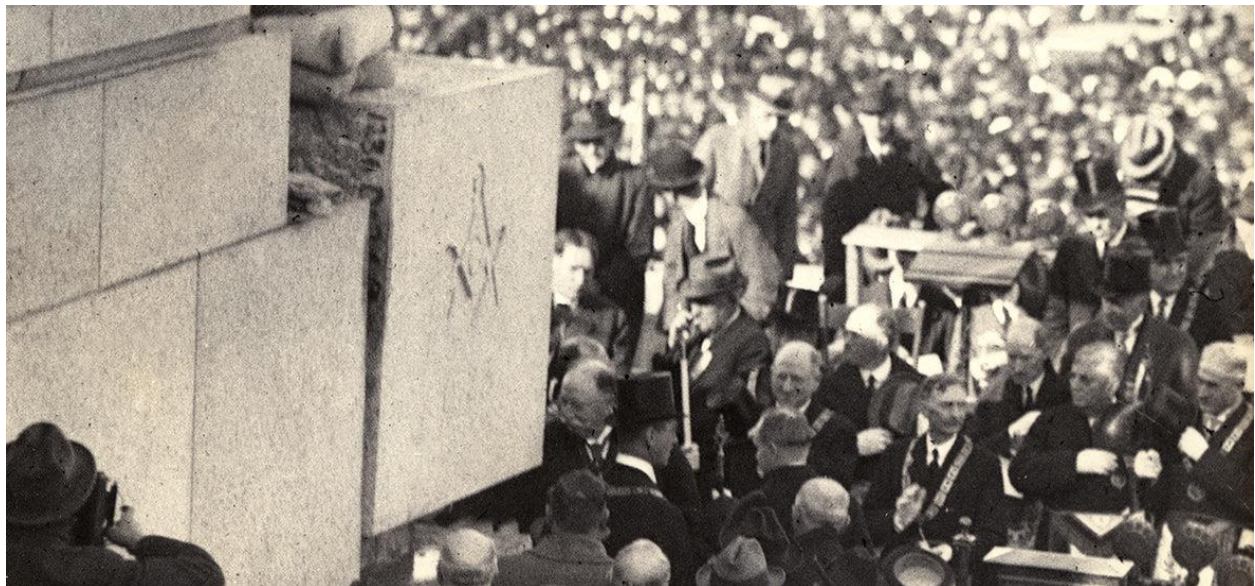
November 1, 1923 Laying of the George Washington Masonic National Memorial's Cornerstone