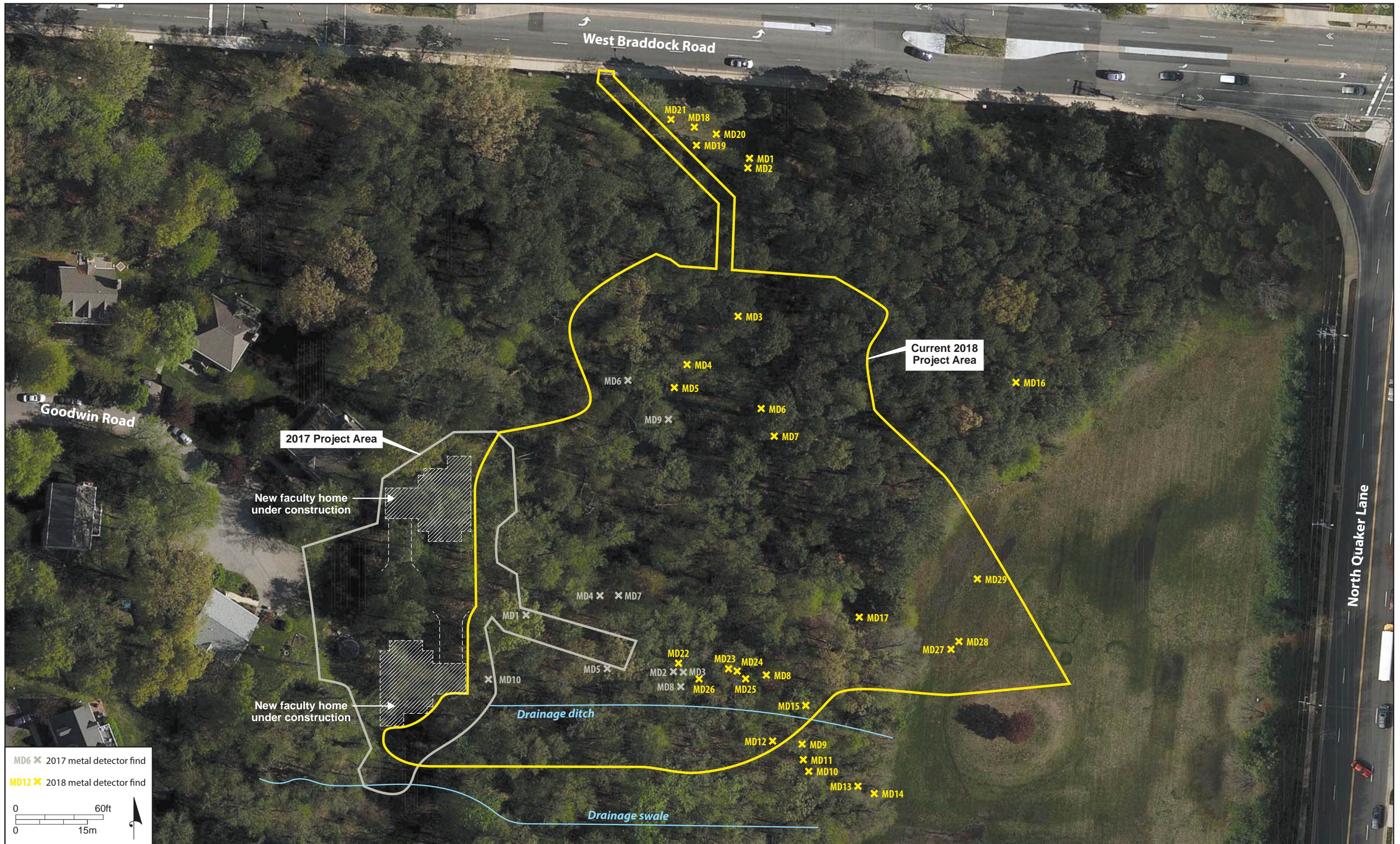
Figure 2. Aerial photograph showing the location of metal detector finds within the project area.